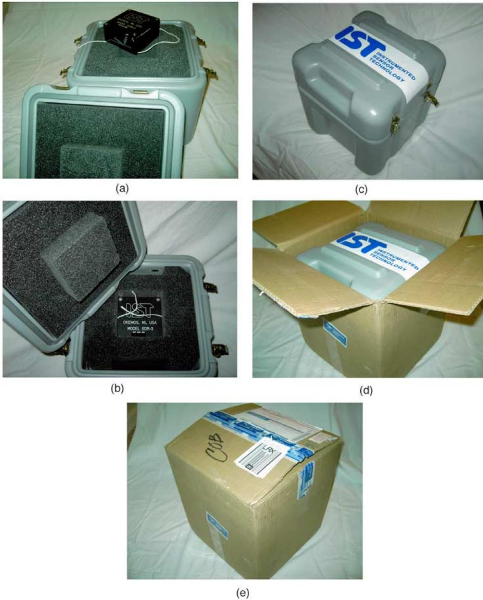
FIG. 1—Instrumented shipment preparation.