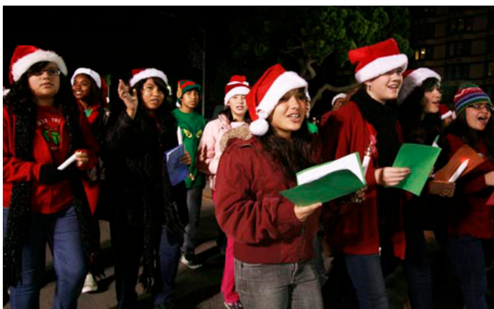
Figure 1.1.2d: Christmas Parade of Lights (2010)

Revived in 1995, the Christmas Parade of Lights (Figure 1.1.2d) has been running in its current form under the leadership of the Santa Maria Rotary Club. Running from the Santa Maria Inn to the Town Center Mall, Broadway is completely shut down for the festivities. The parade includes commercial and private floats, as well as marching bands, with an emphasis on the use of lights. Awards are given to the best floats and marching groups with the best use of lights. The event has approximately 2,500 participants and aims to be a community event for the entire Santa Maria Valley.