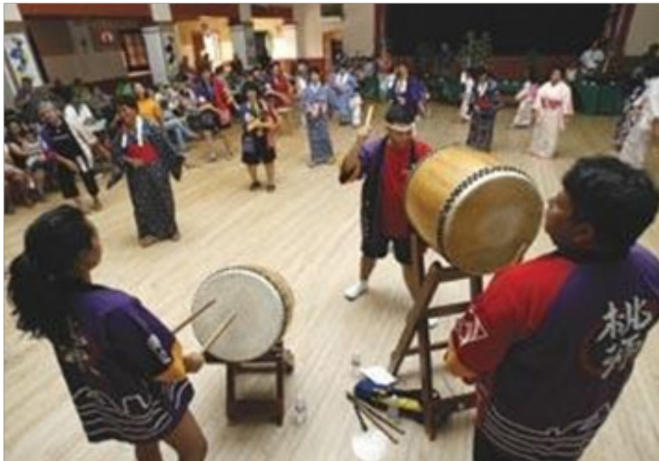
Figure 1.1.2c: Obon Festival

The Obon Festival is a yearly Japanese cultural festival held in Santa Maria each July since 1960 at the Veteran's Memorial Community Center. Open to the public, the festival offers a variety of traditional Japanese food and entertainment experiences. The events of the festival include bonsai, taiko drums (Figure 1.1.2c), martial arts, and Japanese crafts. In addition, the traditional Bon Odori dance is performed to the taiko drumming with dancers dressed in customary kimonos and Happi coats. Food available includes teriyaki chicken, sushi, kushiyaki, and udon. The Obon Festival is one of the most significant Buddhist observances, and is traced back to the Buddhist story of Moggallana, in which a Buddhist monk rescues his mother from condemnation. The festival is meant to combine solemn reflection with a celebration of ancestors who came before and commemorates the time of year when spirits of the dead are thought to return to earth.