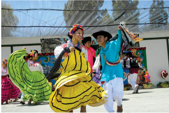
Figure 1.1.2b: Guelaguetza Festival