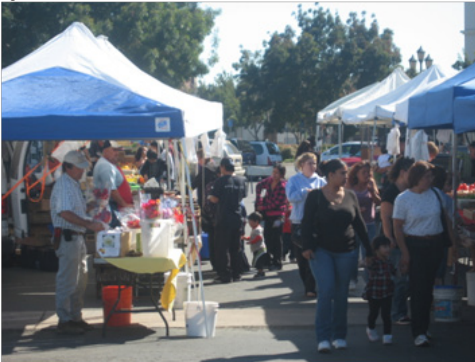
Figure 1.1.2a: Farmer's Market

In 1980, Santa Maria's weekly Farmer's Market (Figure 1.1.2a) was established by two local family farmers who received non-profit certification. The Market is held every Wednesday on the corner of East Main and South Broadway. It attracts vendors from all throughout the Santa Maria Valley region, who are looking to sell a vast variety of fruit, vegetables, and other natural, locally-grown products. The Farmer's Market provides a unique opportunity for vendors to expose members of the community to their different cultural foods and for patrons to try something new.