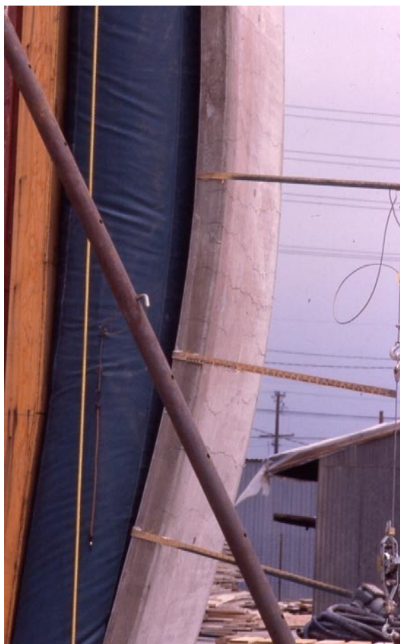
Fig. 2 – Test Panel Showing no Instability