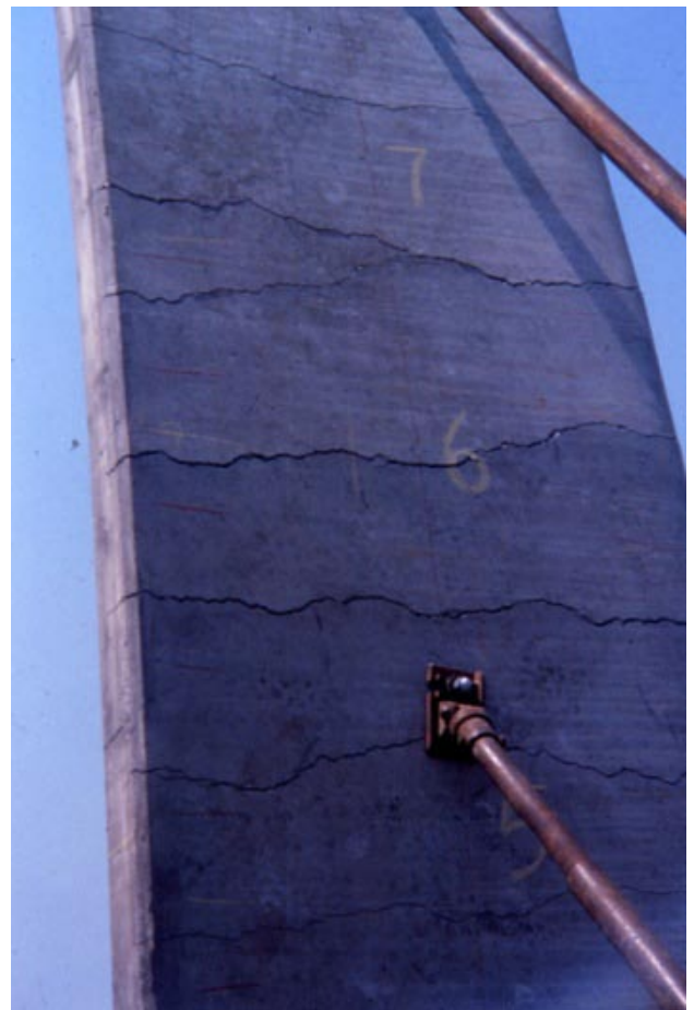
Fig. 3 – Test Panel Showing Cracking Pattern

P_s = Unfactored axial load at the design (midheight) section including effects of self-weight.