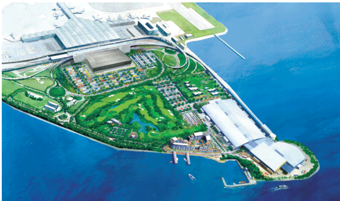
Figure 2: An artist's Rendition of SkyCity, Hong Kong Airport