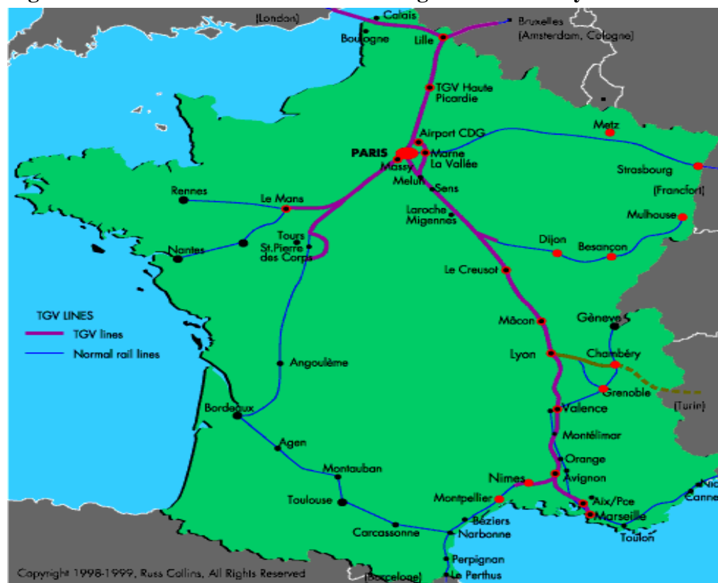
Figure 3: TGV Network of France Showing Locations of Lyon and Lille