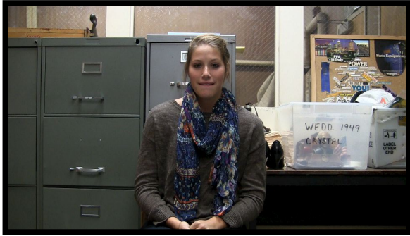
Atascadero High School Student

project is amazing. For those students who have never shown an animal before and now have, the student now knows that there is something else that depends on them.