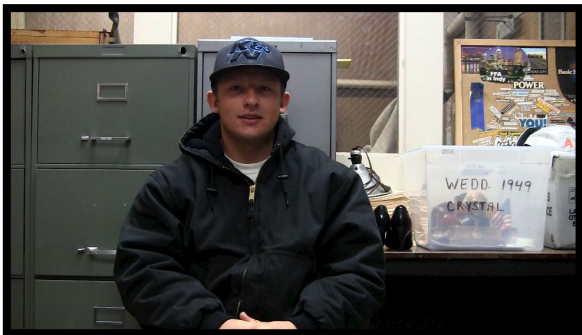
Atascadero High School Student

A student from Atascadero High School explains how she learned about SAE projects. This student has been showing animals for many years since she was a little girl. It wasn't until she entered the FFA program once she began high school that she learned what an SAE was and what it entailed.