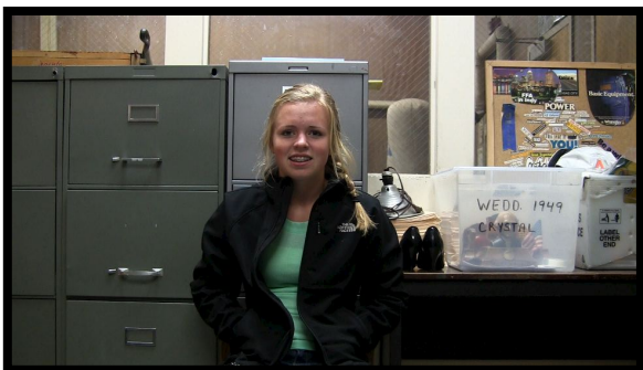
Atascadero High School Student

A student from Atascadero High School explains what his SAE projects are. This student shows swine as well as building industrial arts projects (agricultural mechanics). He mentioned that he enjoys showing swine as well as building projects. He likes to show his pigs as well as making a small profit from both his swine project and industrial arts project.