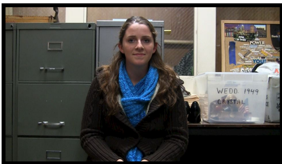
Atascadero High School Student

A student from Turlock High School answers the question, "Has your SAE motivated you in earning your Chapter, State and America Degree?" The student responds by saying that it has made him think about it because the more that he gets involved, the more he wants to be successful.