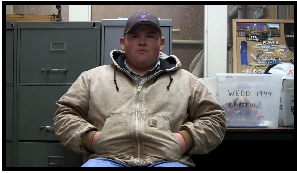
Atascadero High School Student

A student from Atascadero High School expresses what his favorite thing about agriculture is as well as his SAE project. He said that his favorite thing about his SAE project is the competition. He enjoys being able to get his pig ready for the show and having the judge see how much work he has put into his project. He says that by having the judge see his pig it reflects the hard work he has done to get his pig ready for the livestock show.