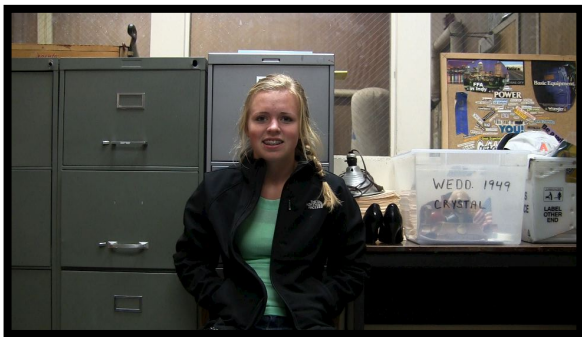
Atascadero High School Student

A student from Atascadero High School expresses what his favorite thing about agriculture is as well as his SAE project. He said that his favorite thing about his SAE project is the competition. He enjoys being able to get his pig ready for the show and having the judge see how much work he has put into his project. He says that by having the judge see his pig it reflects the hard work he has done to get his pig ready for the livestock show.