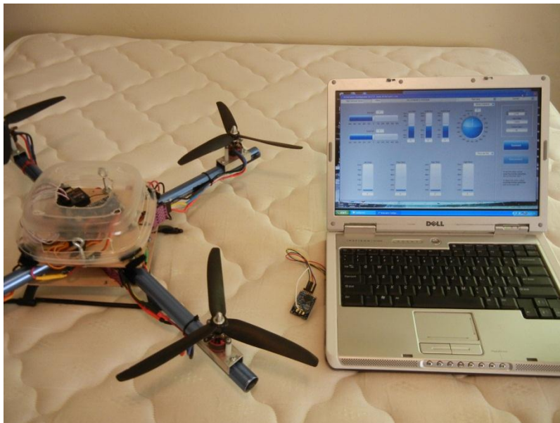
Figure 1. Schematic of the quadrotor with laptop test setup showing the Arducopter's Configurator.

Data taken from the quadrotor will be compared to both anemometer readings and theoretical calculations of wind speed in the surface boundary layer. The quadrotor uses the Arducopter Mega IMU from DIYdrones.com 5 with the addition of the DIYdrones HMC5843 magnetometer, MediaTek GPS module, and two 900 Mhz Xbee modules for telemetry data. This setup will provide for both altitude and GPS hold while flying, allowing for data collection at specified altitudes. Figure (1) shows the quadrotor next to a laptop that will be used for the ground station and the Xbee module that will be used for real time telemetry.