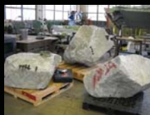
Left to right - 3 rocks prepped for experiment and 2.2 ton rock and Garrett prior to transport

We plan to conduct lab experiments measuring the effects on 2-4 ton rocks. Using hydraulic cement inserted into the rocks over time will generate large amounts of pressure to cleave the rock. During this build up of pressure many analytical tools will be used.