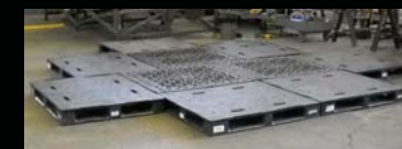
Plastic Pallets used for a platform in the experiment