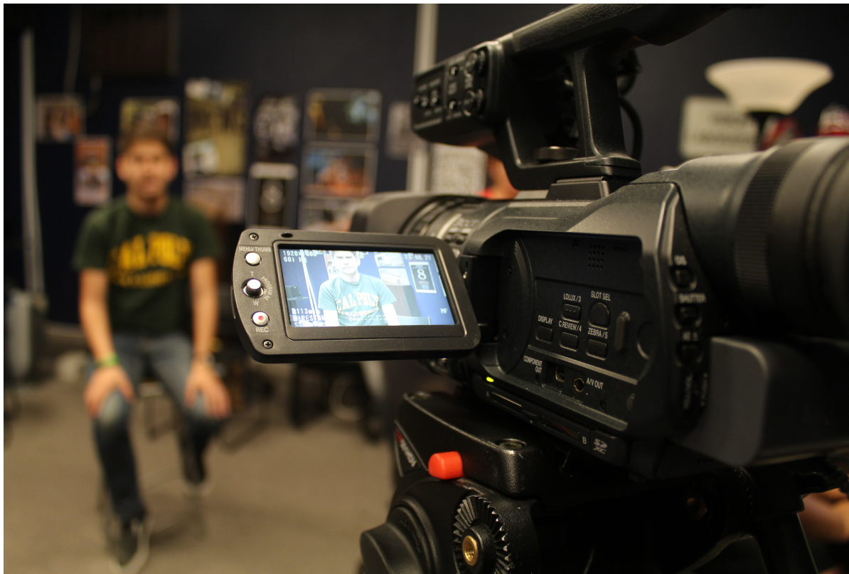
Figure 2: Filming an interview in the LAES lab with the JVC camera

I chose to use Adobe Premiere Pro because I have the most recent exposure with that non-linear editing software. I also have Final Cut Pro 7, each functions in a similar manner, so Premiere was my editing software choice due to more recent usage.