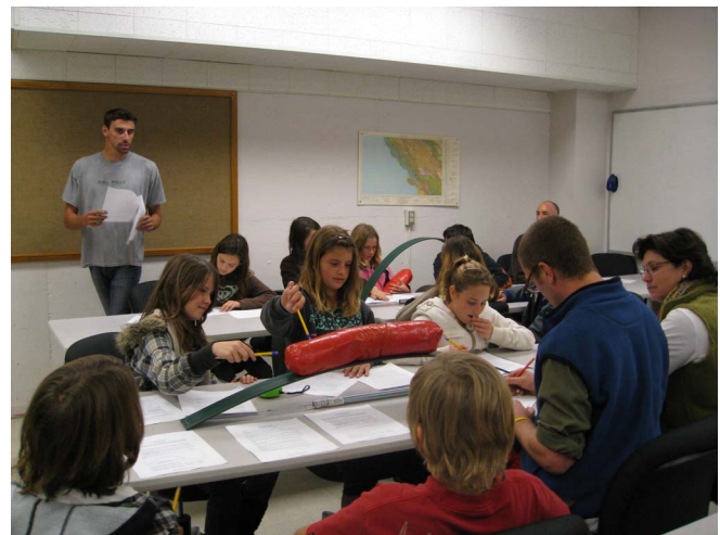
FIGURE 1 ARCH ACTIVITY

In a similar manner we developed the story of Eiffel and his tower using as a basis the excellent biography by