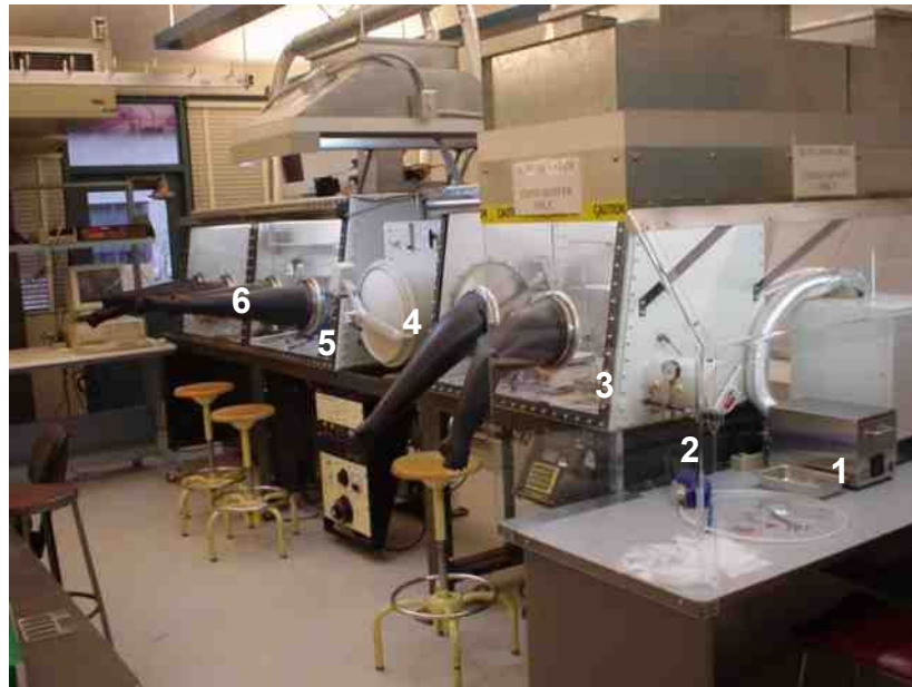
Figure 2 – Polymer Electronics Laboratory

theoretical emphasis. One lecture session on the first day of class and mini-lectures and discussions during subsequent lab sessions provide sufficient support for the laboratory activities, but only contain essential supporting theoretical concepts. Second, offering the course as a one-unit class that meets for one three-hour lab session each week of a ten week quarter makes the course more appealing to some students. A tension exists as more units compress into the undergraduate curriculum, and this one unit course is a relatively small investment of time for students who feel pressured by having to take many units of coursework. Students who the course excites to further study may proceed to a full microelectronics fabrication experience. Other students may receive a meaningful introduction with less time investment on their part compared to a more extensive integrated circuits fabrication course.