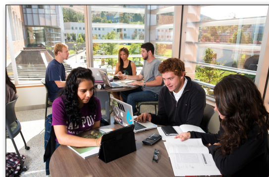
Students in new Warren J. Baker Center for Science and Mathematics