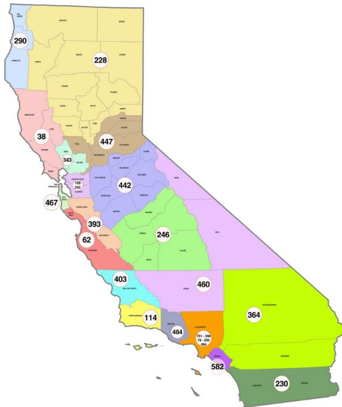
Figure 1: California UA Jurisdictional Map

The presence of multiple labor unions in a region can create complications for contractors. As seen in Figure 1, the state of California, particularly the Bay Area, is one of these such regions when it comes to the union pipe trades.