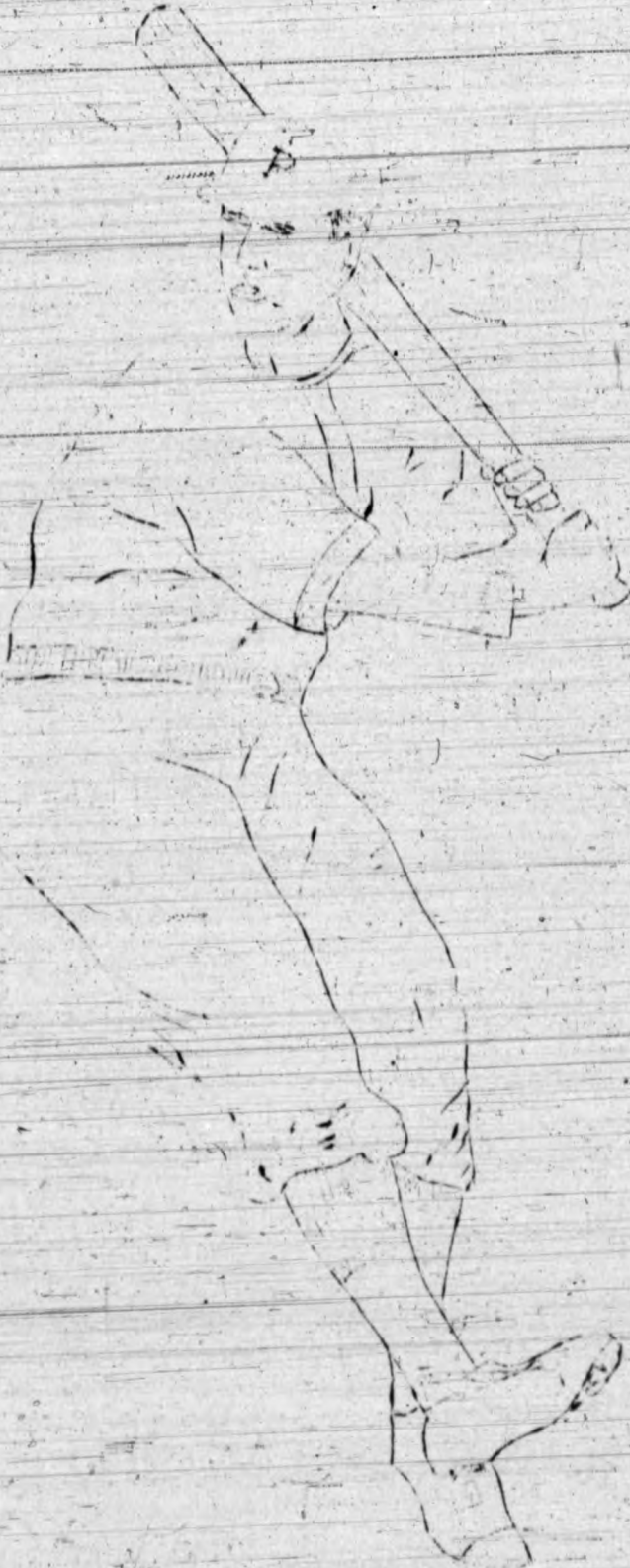
SCOTTY AT THE B&T.