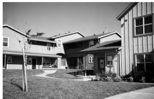
Figure 2. The San Andreas Community housing project, in Santa Cruz

The project exemplifies the feasibility of widening housing opportunities to those who typically cannot afford. Built in a 1.19 acre site, the San Andreas project is a residential community which has 43 rental units of high quality affordable housing for very-low income families. Units average around 1,000 square feet and range from one to four bedrooms. In fact, this rental project is targeted at those who earn at least 50% of their income from working in agriculture. Special infrastructure include wastewater treatment for irrigation, and on-site amenities include a playground and a