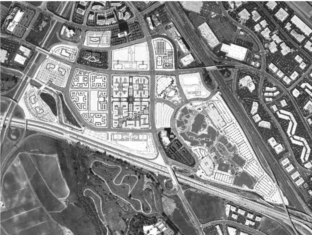
Figure 6. The Irvine Center Village, nestled between interstate highways and the Irvine Spectrum shopping center in Irvine, CA

Another question raised is that as interesting as the architecture choices are at the Irvine Spectrum Village, they do not necessarily guarantee a recognizable community. Is the sense of place achieved in this village representative of the other communities in Irvine? Another issue that will certainly deserve more attention is affordable housing, planned to be implemented outside the project are on the other side of the freeway in a currently blighted, underdeveloped zone.