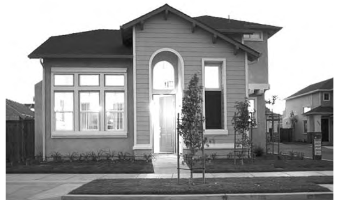
Figure 5. The Promenade, River Oaks Community in Paso Robles, CA

In developing the site plan, careful attention was paid to ensure that these separate components were well integrated into River Oaks. Residences are divided into seven neighborhoods ranging from 90 units of rental to larger semi-custom homes. The mix of housing opportunities allows for a variety of families with differing lifestyles and incomes to live at River Oaks. The “MarketPlace” provides River Oaks with basic