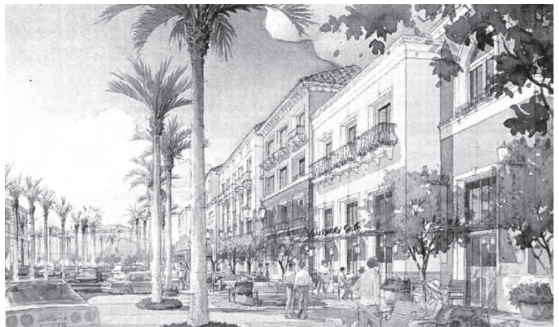
Figure 8. Rendering of the main street at district three of the Irvine Center Village, with its architecture influenced by Italian and Romantic references