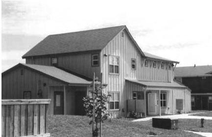
Figure 3. The community center at San Andreas Community, Santa Cruz

community center providing for programs such as English as Second Language and job skill classes, meetings, and health programs such as Dientes and Salud para la Gente (Teeth and Health for People) (Figure 3). There is also a sheriff's substation on the premises.