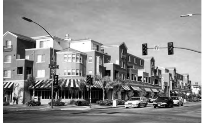
Figure 1. The Mid-Pacific Housing Coalition's City Center Plaza in Redwood, CA

A second project, City Center Plaza in Redwood City was also discussed (Figure 1). This mixed-use project in an urban setting has a retail component along with 81 family housing units. Fran Wagstaff emphasized the design process of this development, including the avoidance of interior corridors and the MPHIC's insistence on outdoor entrances. Rather than creating a separate parking area, the parking for this project was tucked under the housing units and behind the retail space. Residential space was organized around courtyards and the units were designed to reject the building typologies normally reserved for low-income housing. Instead, the coalition (city, MPHIC, and retail partner) made sure this project was a place of residence that its inhabitants