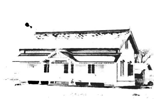
Fig. 2 Chokusôtei in Sapporo (1873)

One obvious objection to the integrated model suggested above is that architectural history, which is often marginalized in professional departments, will be co-opted by other fields, causing the loss of autonomy for the historians. In fact, though, all courses—in the mythical ideal department, at least—should be developed to guarantee scholarly freedom for the instructor on one hand and curricular effectiveness on the other. By relating history more closely to broader pedagogical goals, the new survey may in fact offer the possibility of bringing into the classroom more specialized history topics—perhaps drawn from the historian's particular interests. The sites for teaching architectural history may expand to the practice and design classes.