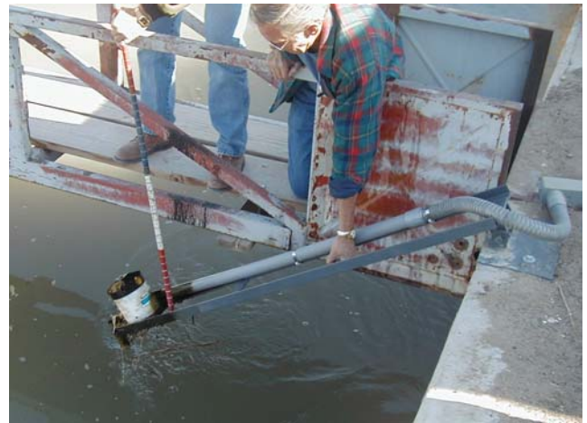
Figure 5. Mounting hardware for Argonaut SL at Truckee-Carson Irrigation District

The user selects the velocity equation used for computing flow and loads the channel geometry with up to 20 cross-sectional points (x-y pairs). The index coefficients for establishing the empirical velocity relationship in the channel are determined through regression analysis. For guidelines refer to Canal Velocity Indexing at Colorado River Indian Tribes (CRIT) Irrigation Project in Parker, Arizona using the SonTek Argonaut SL (Irrigation Association 2003).