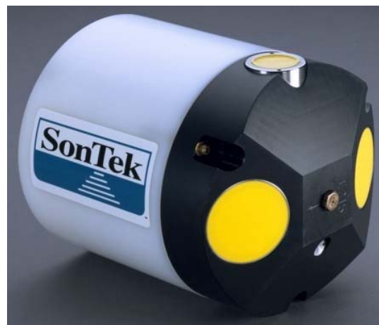
Figure 1. SonTek Argonaut™ SL Doppler Flow Meter

The Argonaut SL is designed for side-looking operation from underwater structures such as channel walls. The Argonaut acoustic sensors, receiver electronics, temperature sensor, pressure sensor and processor are configured in a pressure housing (see Figure 1).