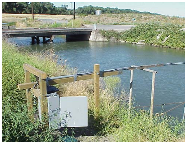
Figure 3. Tisdale Main Canal

Flow discharge was the product of the mean velocity and cross-sectional area (computed from the water level and cross section profile). The flow rate in the canal was computed in post-processing analysis.