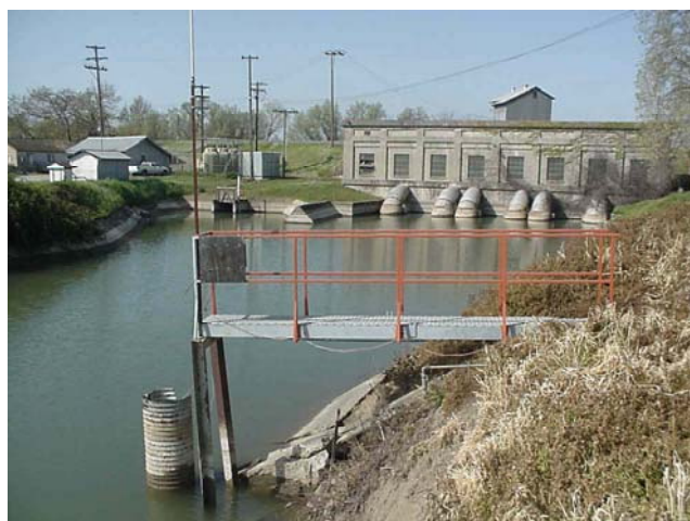
Figure 2. Tisdale Pumping Plant

The Argonaut SL was utilized to measure the daily flow volume from the Tisdale Pumping Plant. The pumping plant supplies water from the Sacramento River to the Tisdale Main Canal (see Figure 2). The average flow rate is 525 cfs.