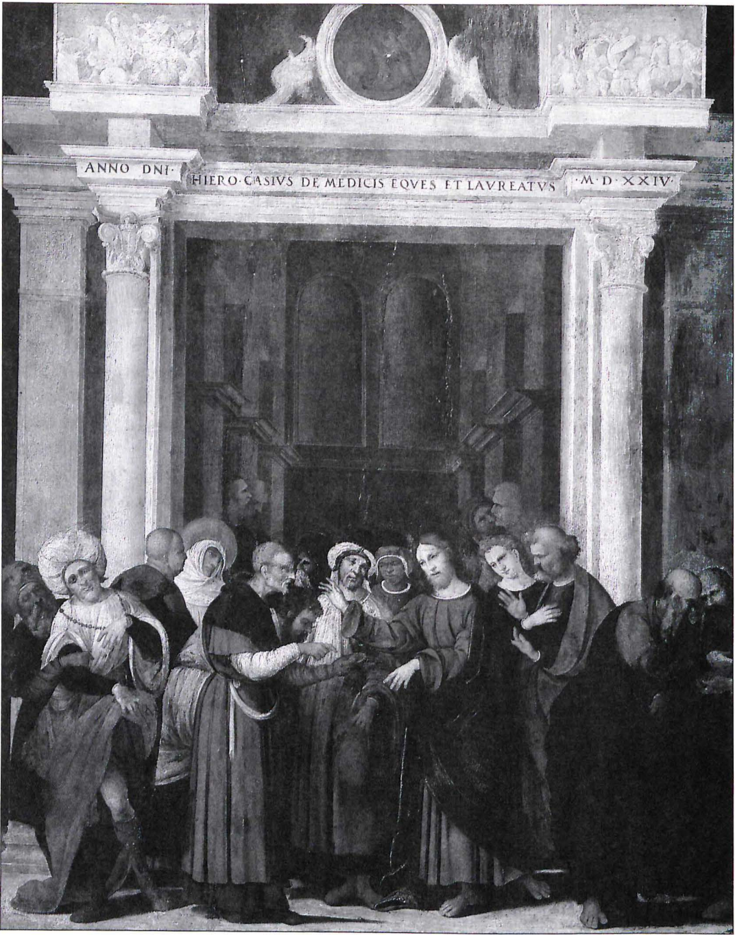
FIGURE 5.6. Ludovico Mazzolino, The Tribute Money , 1524, oil on wood, Poznań, Muzeum Narodowe.