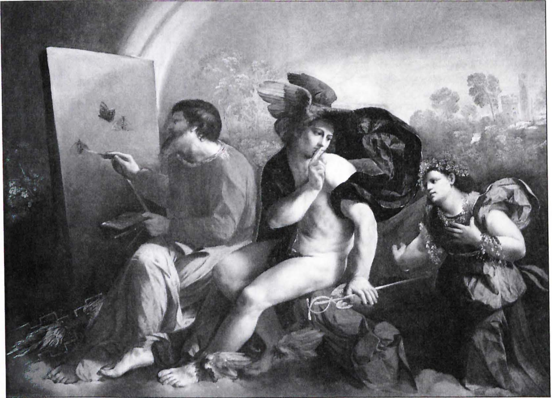
FIGURE 5.1. Dosso Dossi, Jupiter Painting Butterflies , ca. 1524, oil on canvas, Kraków National Art Collection, Wawel Royal Castle.