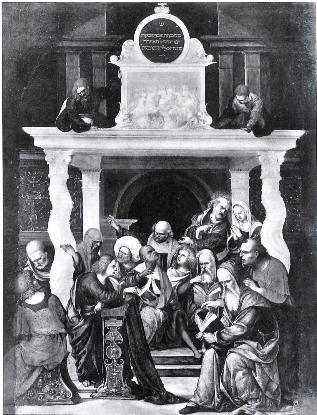
FIGURE 5.4. Ludovico Mazzolino, Christ Disputing with the Doctors , ca. 1520, oil on wood, Rome, Galleria Doria Pamphilj.