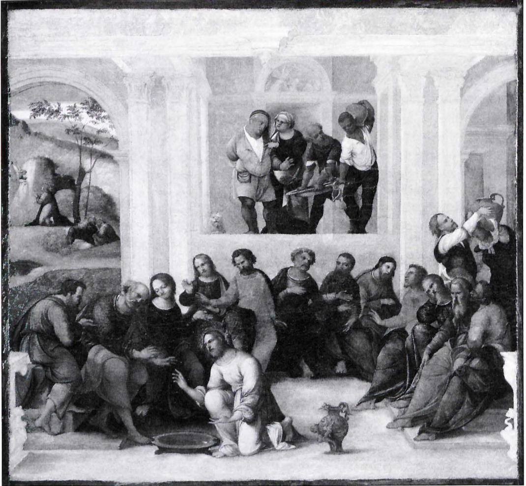
FIGURE 5.2. Ludovico Mazzolino, Christ Washing the Apostles' Feet , 1527, oil on wood, Philadelphia, Philadelphia Museum of Art.