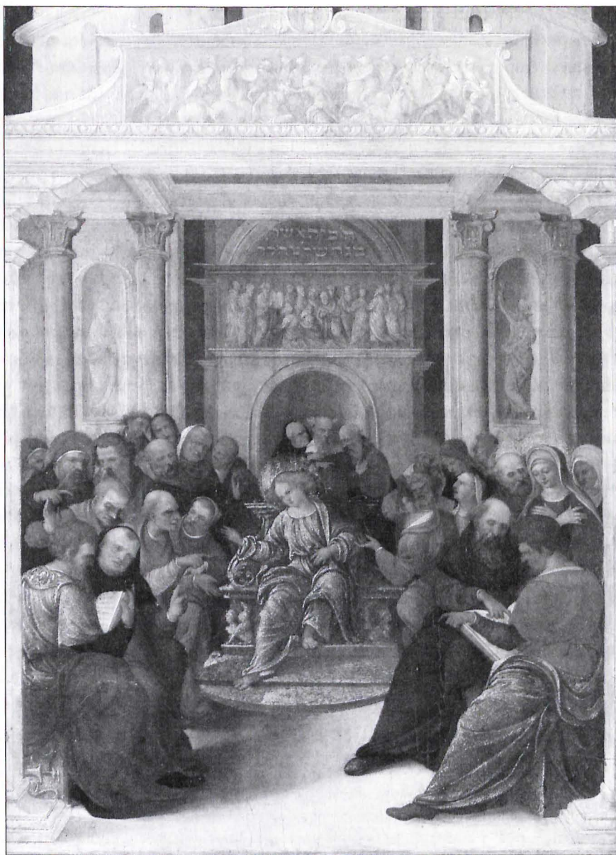
FIGURE 5.3. Ludovico Mazzolino, Christ Disputing with the Doctors , ca. 1522, oil on wood, London, National Gallery.