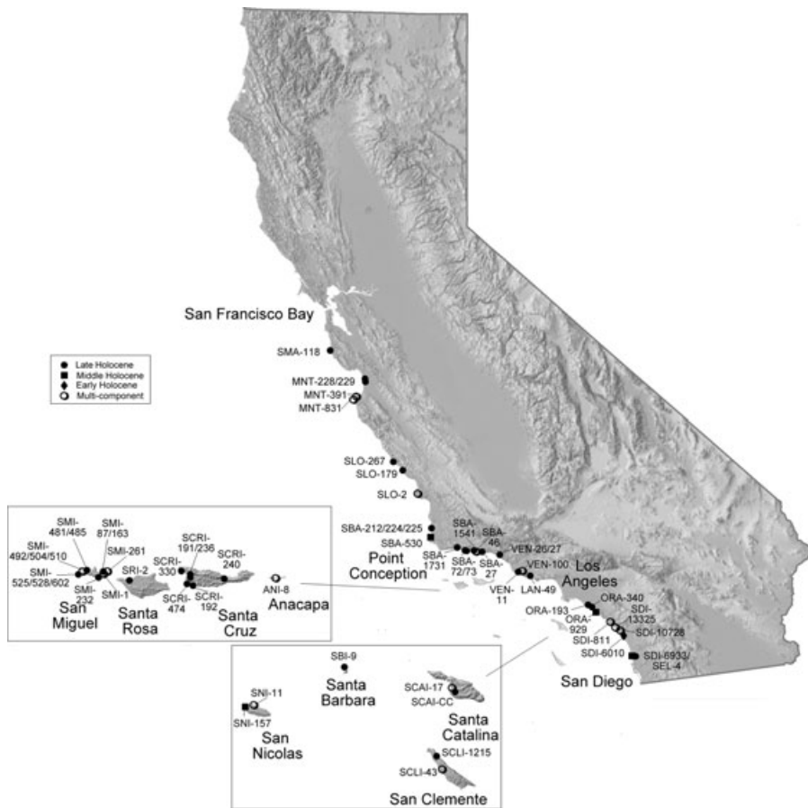
Figure 1. Location of archaeological sites containing Guadalupe fur seal remains in California.

specimens identified to species, excluding those that were identified solely as fur seal. We recorded bone and teeth counts and minimum number of individuals (MNI), an estimate of the total number of animals based on the frequency of non-repetitive elements (Grayson 1984, Lyman 2008). When available, we also included age and sex estimates.