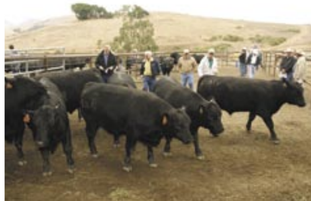
Above: Buyers examine sale bulls at the 50th Annual Bull Test Sale. Right: The sale ring at the newly completed beef center, where the event took place.

In order to demonstrate the Field Day’s message, all of the bulls auctioned off at the Oct. 1 Bull Test Sale were equipped with Radio Frequency Identification tags. Such tags will be USDA required on all cattle before long, Beckett said. -P