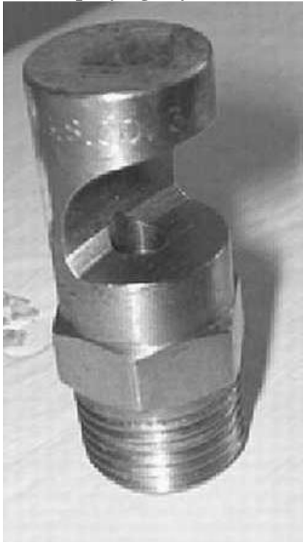
Floodjet SS3/8k-45 nozzle.

The basis for boom length tests and drop-size tests is the nozzle. The Floodjet SS3/8k-