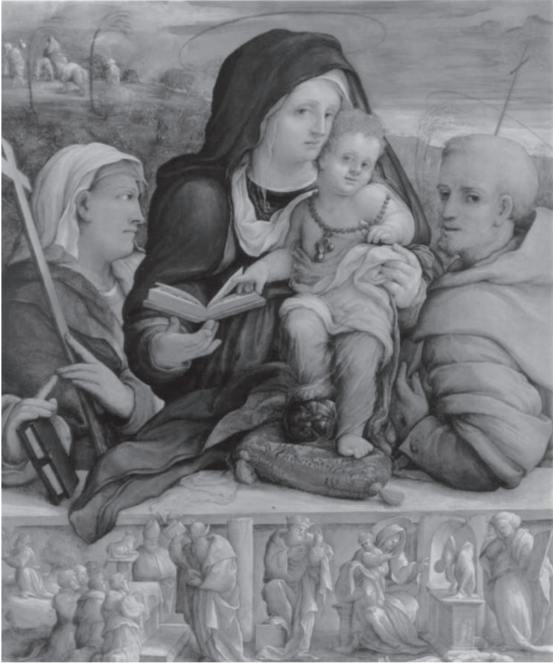
Fig. 9. Amico Aspertini, Madonna and Child with Saints . National Museums and Galleries of Wales, Cardiff.

and saints, the fables fostered the religious edification of the monks as they dined in silence. By the sixteenth century, the fables gained the status of the divine word. The German theologian Martin Luther considered Aesop's fables a form of secular scripture available for communal enlightenment. Luther, in a letter written to the German humanist and Reformer Philip Melanchthon (1497–1560), dated 23