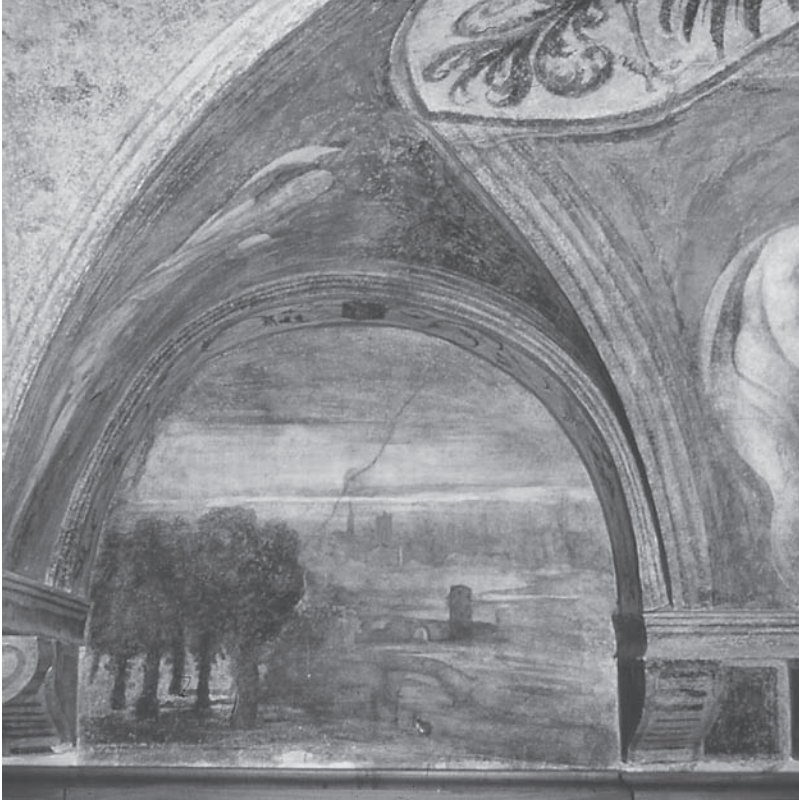
Fig. 5. Dosso Dossi, The Frog and the Ox . Stua de la Famea, Castello del Buonconsiglio, Trent.

treats fresco much in the same way as canvas to give the impression of atmosphere and depict the particular effects of lights. The landscapes, moreover, conform to the appropriate character of palace decoration as prescribed by the Renaissance architect Sebastiano Serlio. Writing in his fourth book on architecture, which was published in 1537, Serlio endorsed painted ornaments for the interior of a palace, and considers landscapes suitable for interior rooms because of the “charm of the colors.” 25 Dosso’s lyrical descriptions of