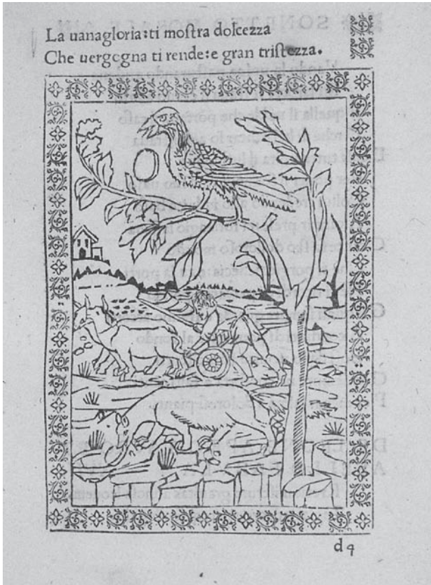
Fig. 4. The Fox and the Crow , woodcut from the Aesopus moralisatus (Verona, 1479).

dinner and drinks ( inter cenas ) in order to arouse laughter and thereby dispel anxiety better than any nauseous medicine. 23 He composed a number of his dinner pieces in imitation of Aesop's fables. The amusing tales, a welcome complement to edifying dinner conversation, are a typological precursor to Dosso's decoration in the dining room of the Magno Palazzo. In fact, a number of the fables Dosso illustrated involve the subject of food. While dining, the cardinal and his companions could reflect upon or discuss the