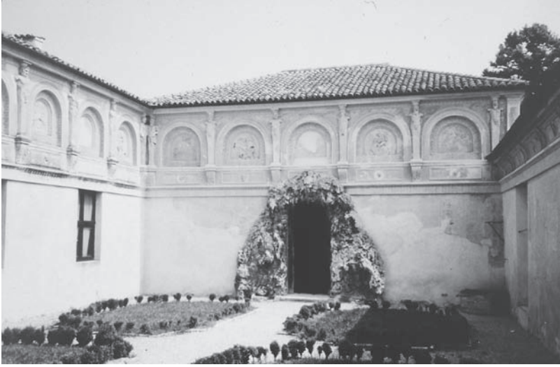
Fig. 8. Giulio Romano, Fables and Terms . Giardino segreto, Palazzo Te, Mantua.