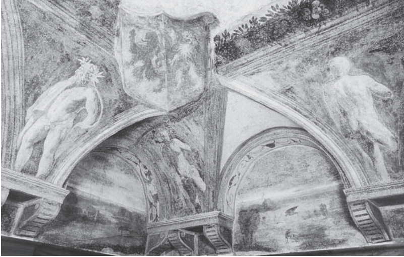
Fig. 2. Dosso Dossi, Fables and Ruins . Stua de la Famea, Castello del Buonconsiglio, Trento.

Important insight into how the decoration may have been experienced comes from the writings of Pietro Andrea Mattioli (1501–1577), the cardinal’s court physician. As a tribute to the newly built palace, which was completed in 1536, Mattioli composed a poem of 445 stanzas in ottava rima dedicated to the description of the Magno Palazzo and its decorations. The poem, Il Magno Palazzo del Cardinale di Trento , was published in 1539, and contains sensitive observations of the artists’ works. Mattioli composed his poem as an ekphrasis (or description), modeled in part after Philostratus the Elder’s Imagines , a text which describes ancient paintings the author claims to have seen in a gallery in Naples. Philostratus even mentions a painting of Aesop surrounded by the animals in his fables. 5 It is therefore reasonable to assume that the cardinal, who was well versed in classical cultural, wished his palace decoration to rival the ancients. The poet Mattioli, by means of ekphrasis , aims first and foremost to display his skill in imaginatively and vividly recreating the mythological and historical narratives depicted in fresco, bringing the imagery before the mind’s eye with a visual and emotive force comparable to the paintings