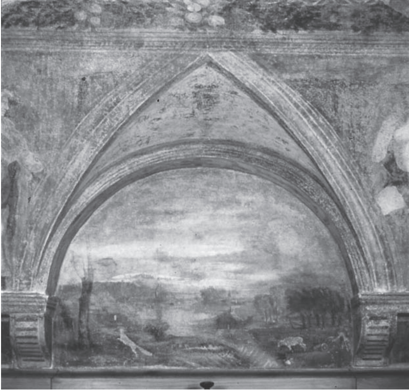
Fig. 3. Dosso Dossi, The Fox and the Crow; The Kite and the Doves . Stua de la Famea, Castello del Buonconsiglio, Trent.

his power and exercises his royal privileges by devouring their offspring one by one. 19 The doomed creatures realize too late that it was better to suffer in war (“ melius bella pati erat ”) than to be murdered without question. The fable admonishes that he who