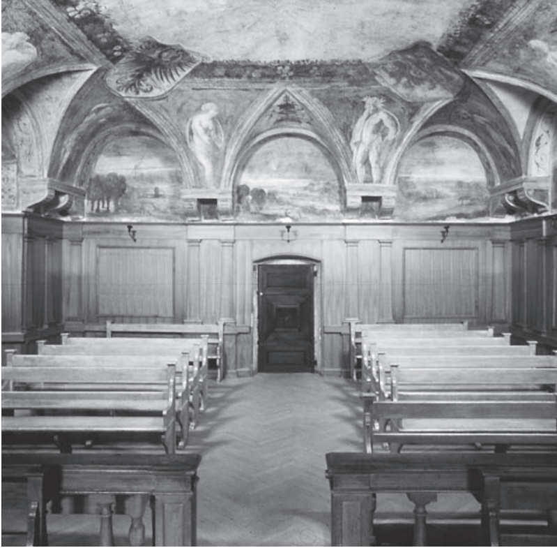
Fig. 1. Dosso Dossi, Fables and Ruins . Stua de la Famea, Castello del Buonconsiglio, Trento.

nary images in the room are the fragmented antique statues painted in monochrome that flank each lunette in the spandrels, numbering fourteen in all (Fig. 2). It is important to note that their nudity was painted over with drapery at a later date. The meaning of the ruined statuary, along with their agonized expressions and agitated poses, has resisted explanation. But neither the fables nor the monochrome statues should be studied in isolation of one another. By investigating Dosso's assumptions and methods in conceiving his pictorial imagery for the dining room, I hope to illuminate what the juxtaposition of Aesop's fables and fragmented ancient statues would have engendered in the minds of Dosso's contemporary audience.