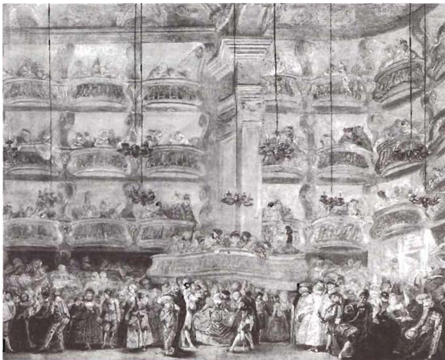
82. Masked ball in the Teatro del Principe: painting (c1770) by Luis Paret y Alcázar