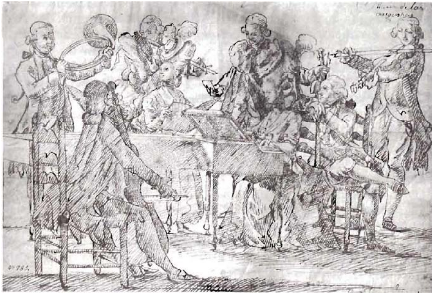
83. Chamber musicians: pen and ink sketch by Manuel Tramullas (1751-91)