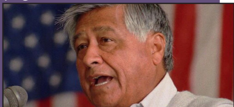
Cesar Chavez Remembered page 3