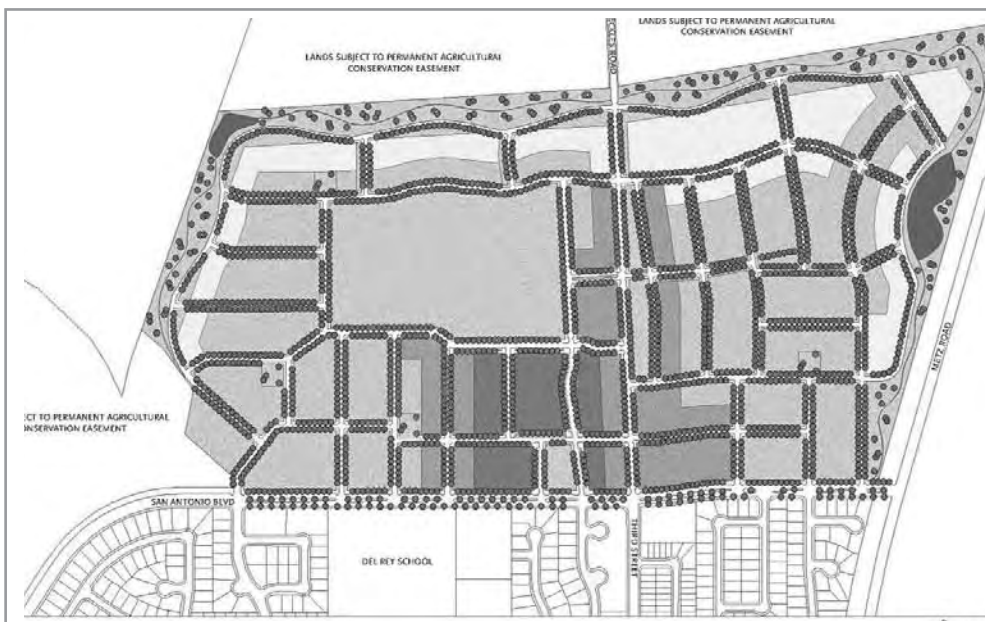
For a code to be effective, there must be a greater blending between the general plan and code content.

As an example: Our office (Crawford Multari & Clark) teamed with Moule & Polyzoides on a code update for the City of Sonoma, California. Sonoma had just adopted a general plan with a new land use diagram based on conventional land use classifications. As we began