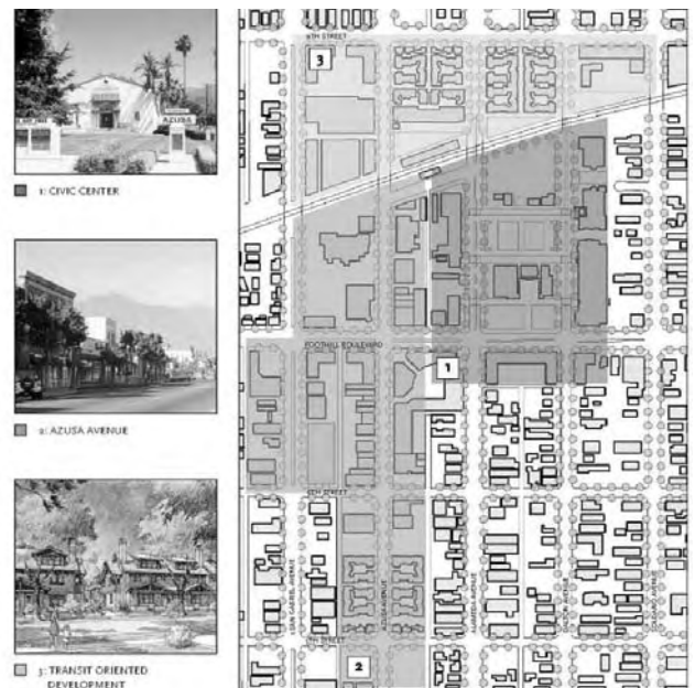
New urbanist codes must address issues of urban form and urban design, as well as land use.

Land use regulation has a necessary and legitimate role in new urbanist codes because, for example, communities often have specific economic development goals that need to consider the nature of uses in a ground-floor storefront. And since the generic land use type of “retail” could be interpreted to include book and shoe stores, but also adult bookstores, auto parts sales, and hot tub stores, the community may be better served by a little more specificity. There needs to be some consideration of land use allocation, because the character and vitality of a community can be diminished by bad judgment on the part of entrepreneurs and developers, which does not seem to be in short supply.