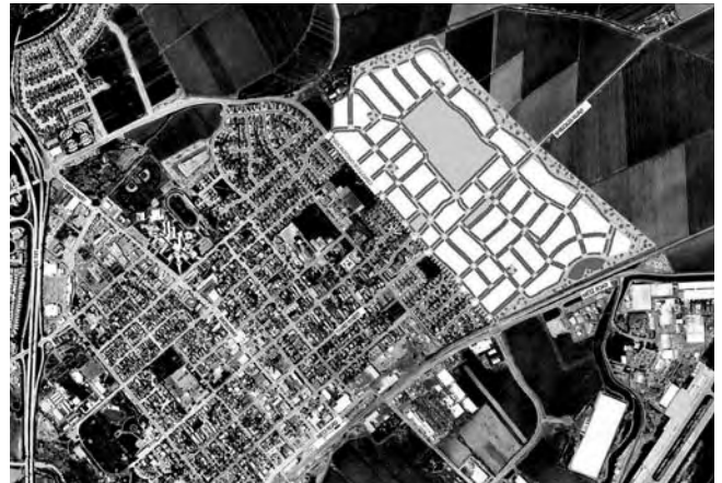
Codes and their mapping need to employ regulatory geography that reflects the ecology of the urban area. The neighborhood, district, and corridor, and the transect certainly do that more effectively than mapping based on single-use zoning districts.

We figured out how to create communities worth living in a long time ago. It clearly is time to think more about how some of the time-tested urban principles can be applied in coding.