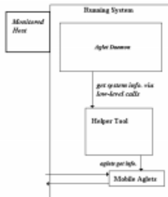
Figure 5 Part III – The Network Host

These are the computers on the network to be monitored. Each network host to be monitored must have the IBM ABE installed on it. This allows the Aglet Daemon to run on it. The Aglet Daemon in turn allows aglets to reside on the host by providing an aglet context or “place”. It is in this context that the aglets reside and do their work. The aglets will have been created by the stationary aglet and dispatched from the management server, and will travel to the host to be monitored. The aglet will be able to autonomously retrieve the process information according to the process criteria specified by the user (through the help of the Helper Tool). After the information is retrieved, the aglet will travel back to the management server [1].