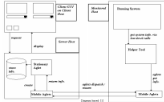
Figure 2 – Overall Project Schematic

of the GUI. A log-file is also created which will reflect the same data as the output of a print. Like the print function, this facility is to be enabled by a button which is found on the user interface.