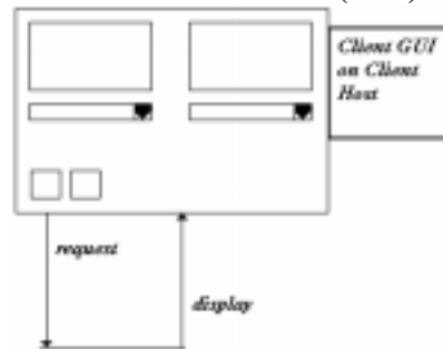
Figure 3 Part I – The Client (User) GUI