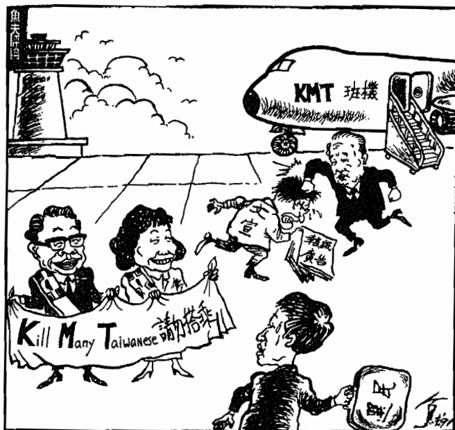
A 1991 pro-DPP handbill urging Taiwanese not to go along with the Guomindang (KMT) in their project of reunifying with mainland China. (Literally, “Please do not board this [KMT] flight.”)

Lee’s twelve-year presidential reign, the second longest in the history of the ROC, saw Taiwan irreversibly transformed from Chiang’s “soft authoritarian” regime to a free democratic society. By 1989 a viable opposition, the Democratic Progressive Party (DPP; Minzhu Jinbu Dang ), arisen from Taiwan independence forces persecuted so violently under the Chiangs, was seriously challenging the Guomindang in county and provincial elections. In 1991, the government terminated the “Period of National Mobilization for Suppression of the Communist Rebellion”—the formal name for martial law—and the limitations on constitutional freedoms it mandated for four decades under the Chiangs. This