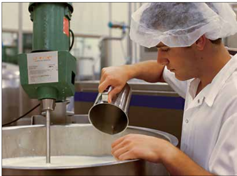
Students accrue practical skills making products such as ice cream, cheese and yogurt in the Dairy Products Technology Center.

"The program provides interaction with high-level dairy processing executives to learn their management philosophies. It combines a balance of classroom, laboratory, and tours of large-scale facilities to give students the knowledge and tools