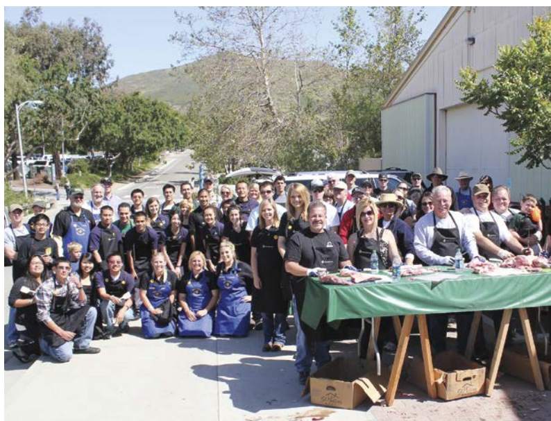
This year's group of 60 local business leaders and community members prepared and fed more than 2,700 FFA state finalists.