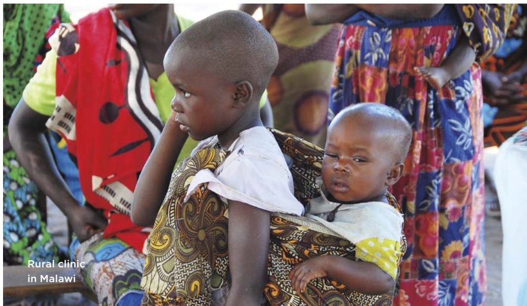
Rural clinic in Malawi