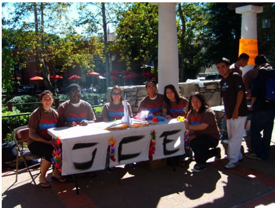
Members of the Japanese Cultural Exchange taught origami during Culturefest

So if you’re interesting in learning more about Japanese culture and traditions, or if you’re interested in being a part of a small club that puts on fun activities, you can e-mail Japanese Cultural Exchange at JCE@Calpoly.edu , find the JCE group page on Facebook, or go to one of their meetings which are held on Fridays from 11 a.m. to 12 p.m. in building 33, room 287.