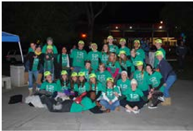
Populations) classes. This past fall, students in RPTA 210

were partnered directly with the Special Olympics of SLO to host a midnight fun run on campus. Proceeds for the event were donated to Special Olympics.