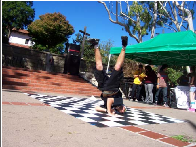
A Member of Hip-Hop Congress Cal Poly Chapter spins during a break at Culturefest X.