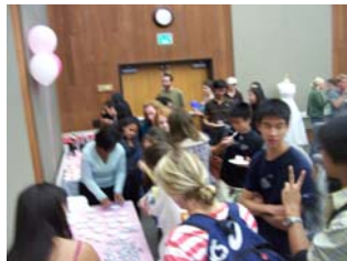
Students create recuerdos at the mock Quinceañera event.

A showing of the award-winning film Quinceañera set the celebration in motion on October 10th. Popcorn, candy