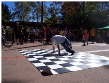
A member of Hip-Hop Congress takes it to the mat while breaking.

Rosenberg also said that "The Hip-Hop Congress