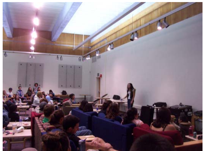
Quinceañera lead actress Emily Rios answers student questions

When asked what she hoped people gained from the