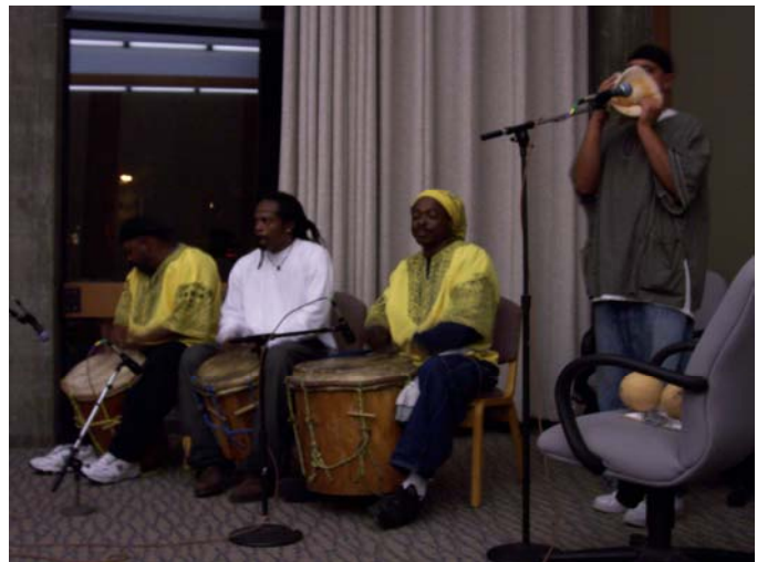
A Belizean drum group plays traditional rhythms and makes use of a sea shell during “A Night in Belize”.

Students were treated to another immersive experience during October 17 th ’s Night in Belize event. Following a presentation on this small and beautiful country, students dined on Belize-style food provided by campus catering and danced to traditional Belizean drum rhythms played live.