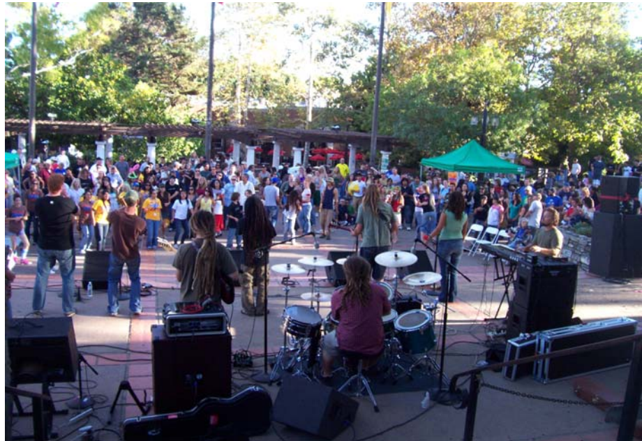
Story and pictures on page 3