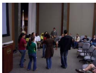
Students dance to the Belizean rhythms during “A Night In Belize.”

UU Room 217 (805) 756—1405 mcc@calpoly.edu