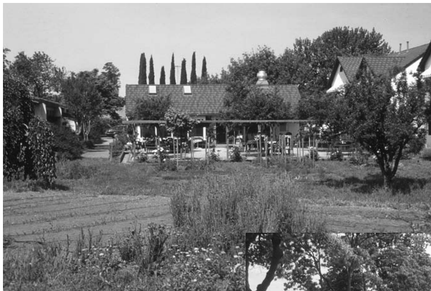
Figure 3. Images of Village Homes