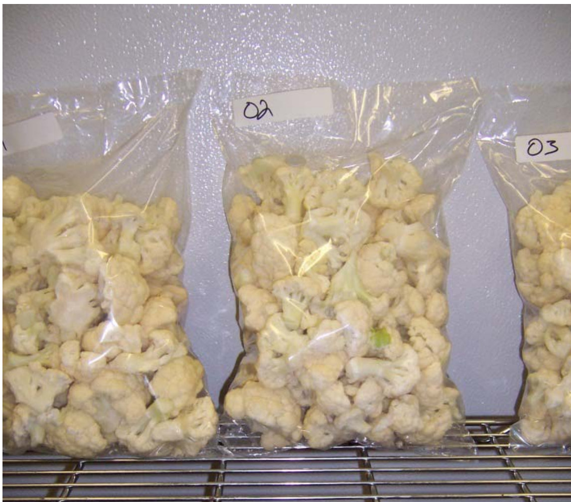
Fig. 3. Microperforated bag packed with 1.36 kg of cauliflower florets. Bags and cauliflower were supplied by Gold Coast Packing (Santa Maria, Ca).