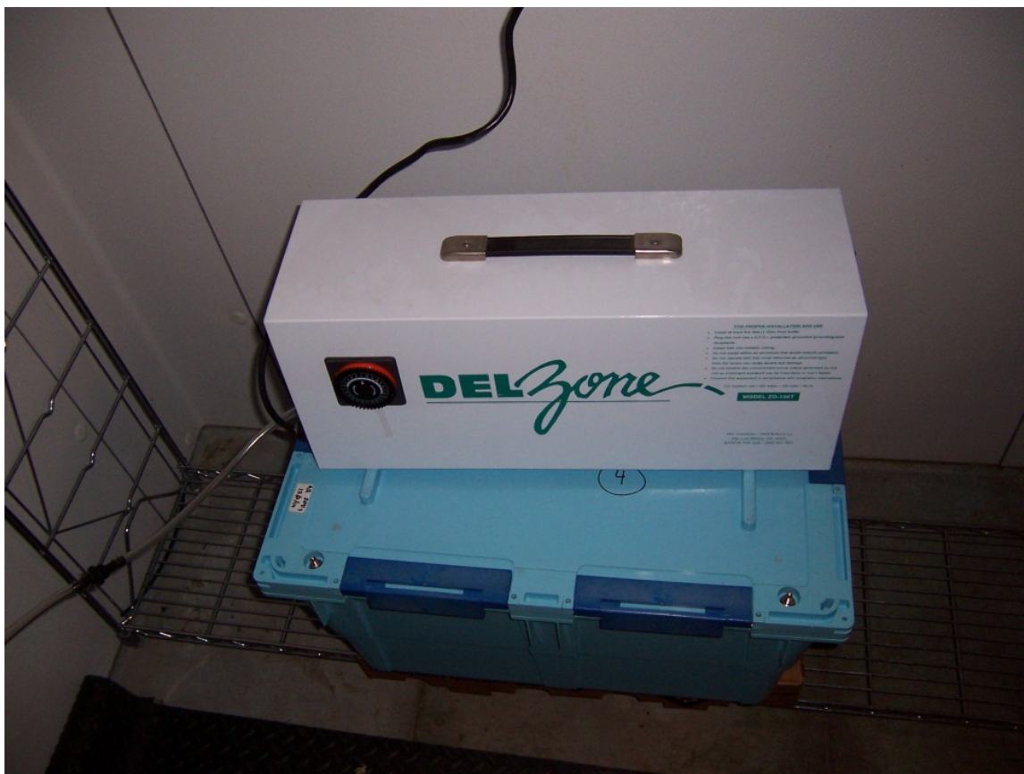
Fig. 2. Del Industries (San Luis Obispo, Ca) ozone generator model ZO-156T produces 150mg O 3 /hour.