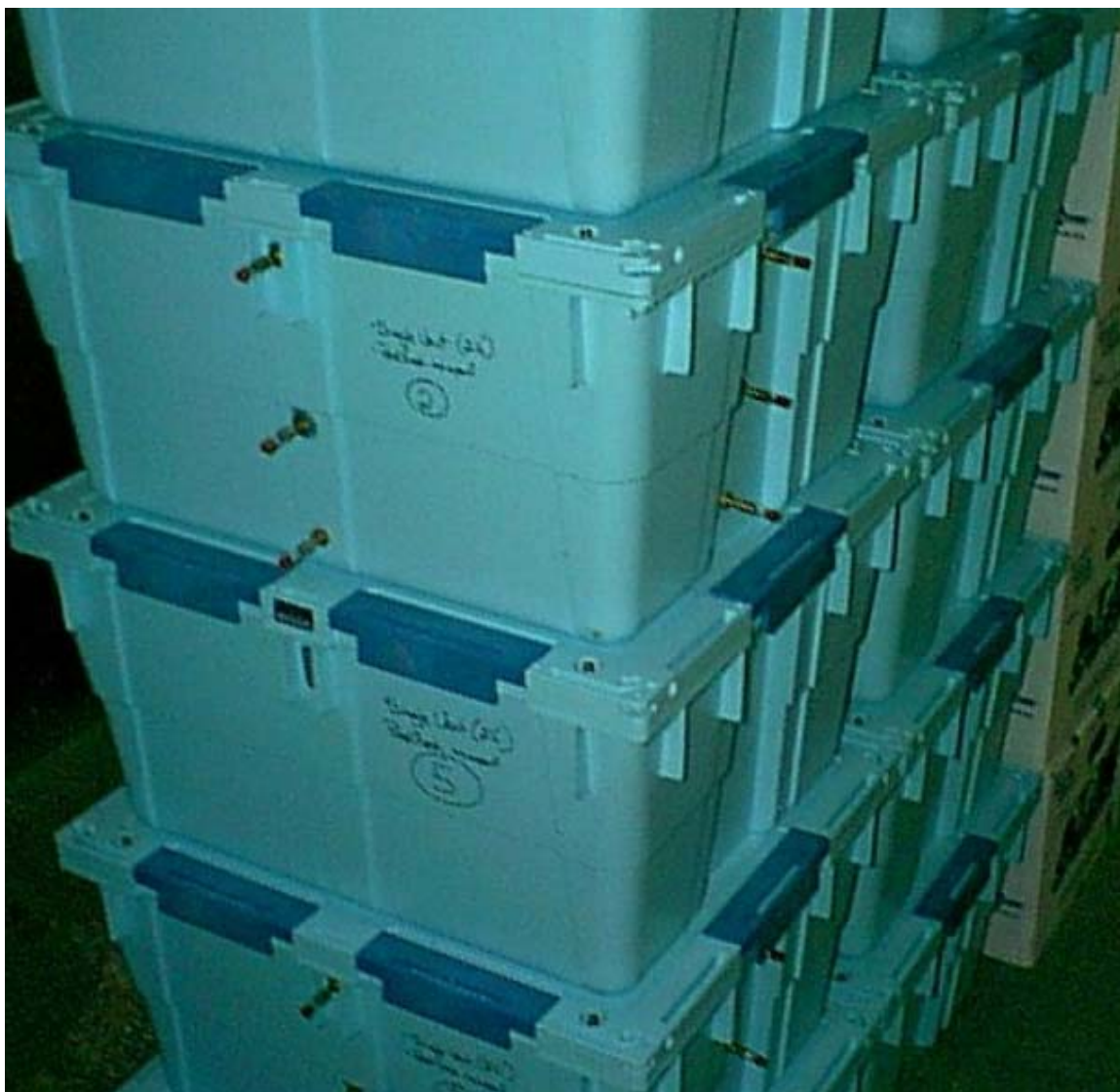
Fig. 1. Plastic modified-atmosphere shipping boxes (SLX International, San Luis Obispo, CA) used to store cauliflower during ozone treatment. Inlets and outlets for the ozonated air are visible.