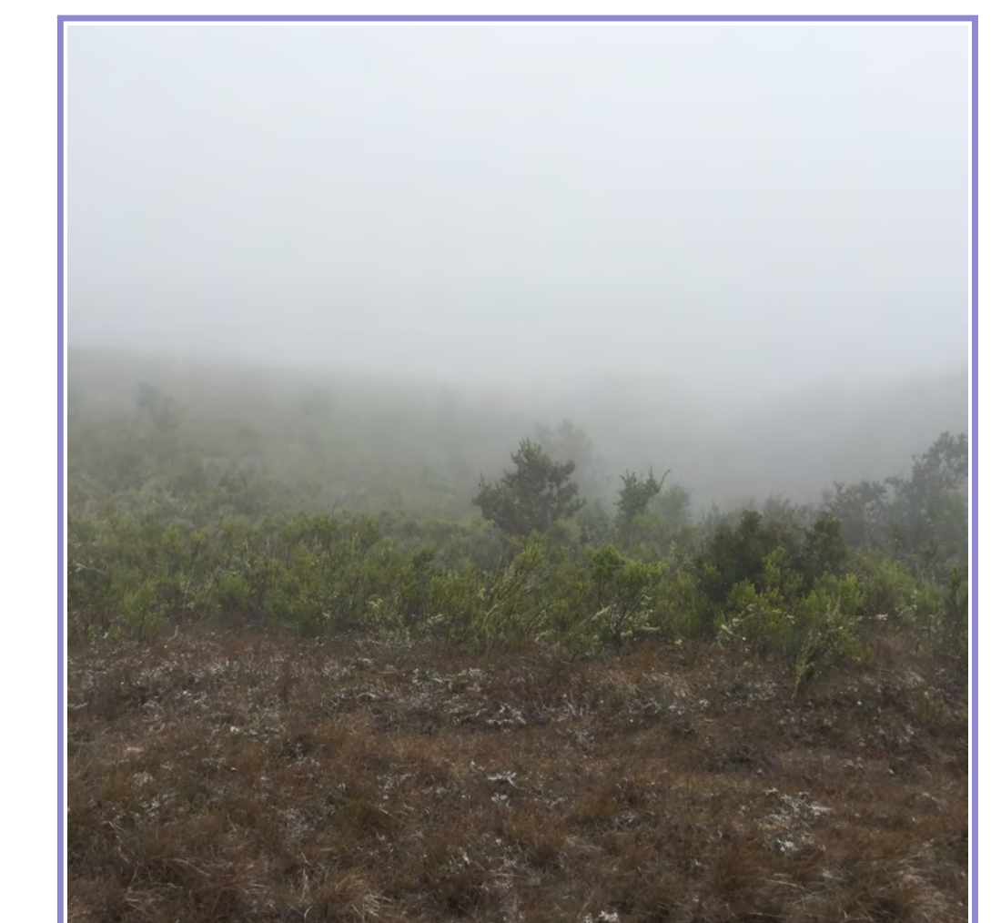
An example of vegetation naturally stabilizing sediment