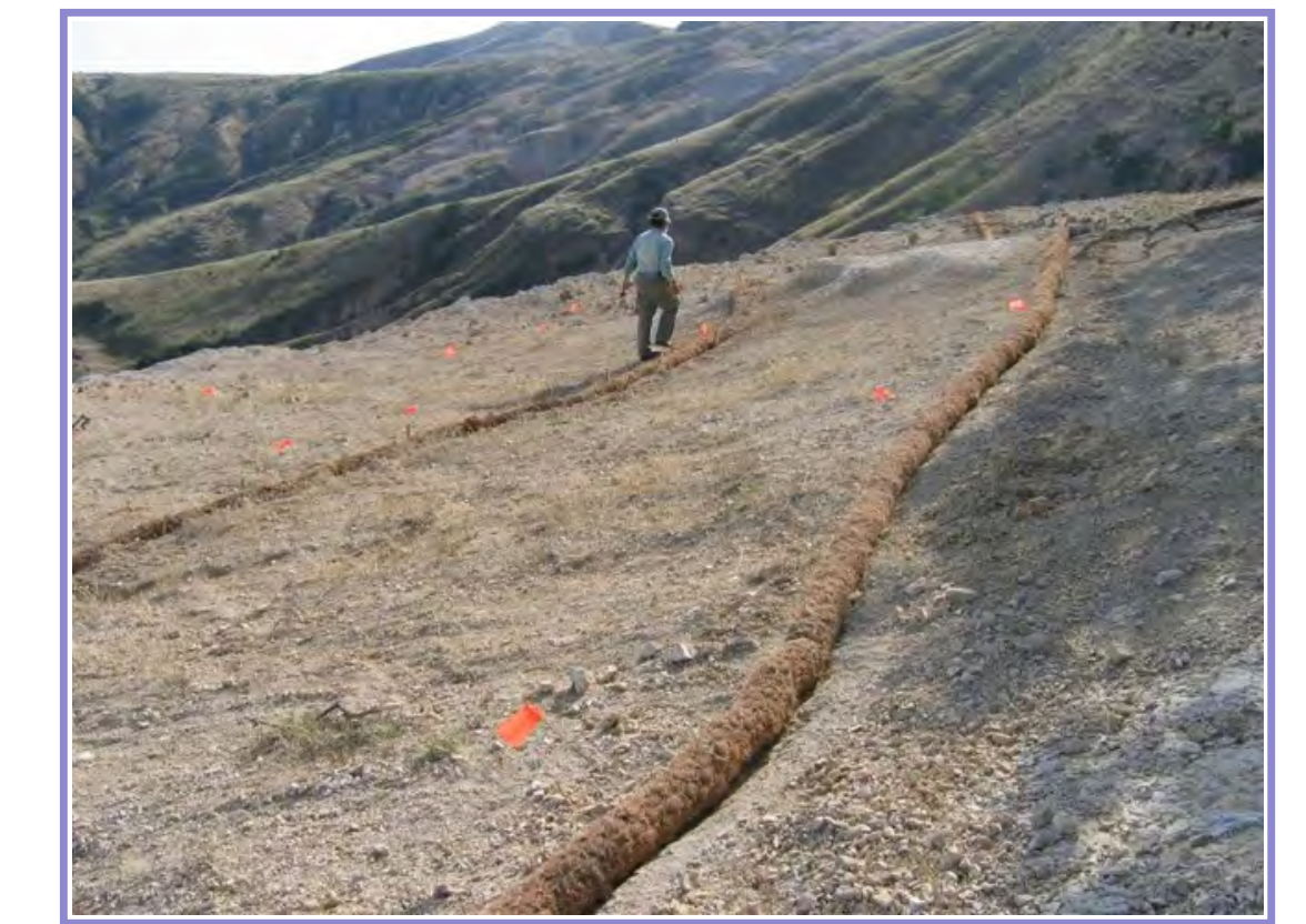
An example of wattles, soil erosion control structures