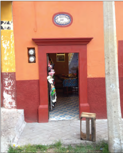
Figure 5 A & B: The modest entry way to the store and the tile above it with the address and the family's name.