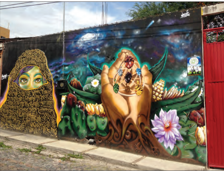
Figure 3: An artist's mural on Canal Street.