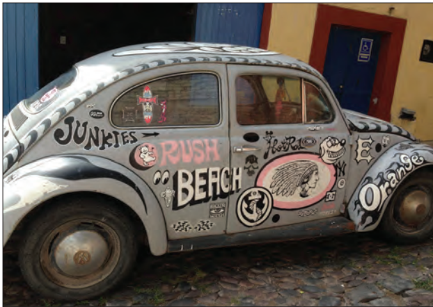
Figures 4 A & B: An artist's billboard and customized transportation (top), and his inside the garage-studio of a surrealist artist, both at Canal Street.