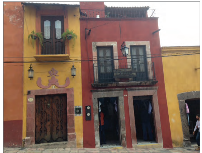
Figure 1: Houses and house/stores on Canal Street.