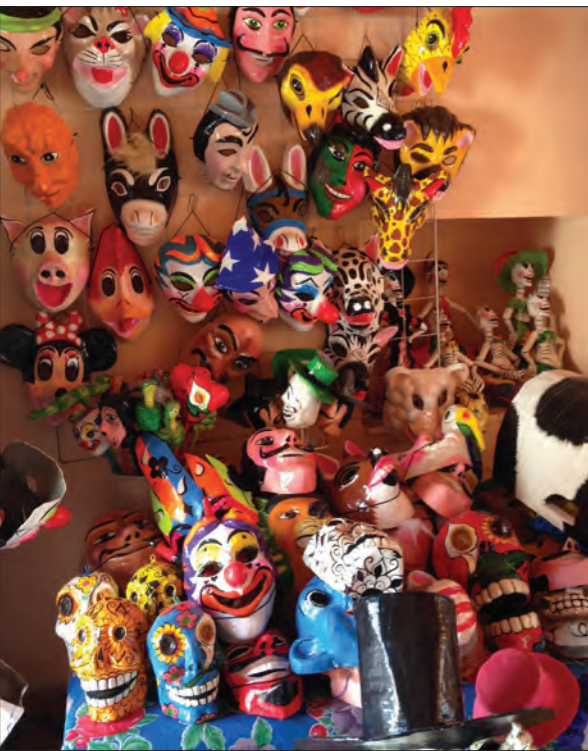
Figure 6: The paper mache masks. Artistic exuberance and creativity an indigenous cultural expression.