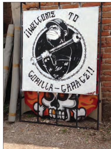
Figure 2: Gorilla Garage.