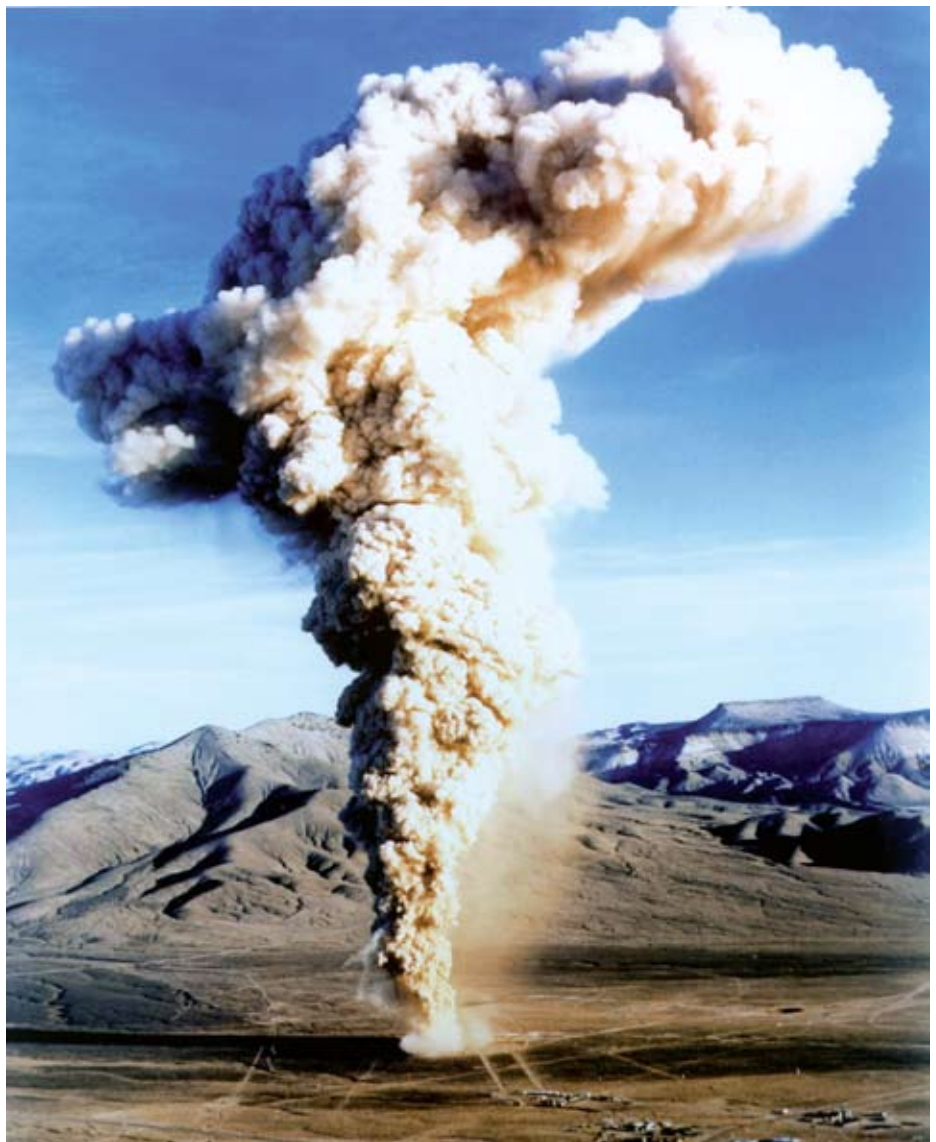
FIGURE 2: THE VENTING OF BANEERRY AT THE NEVADA TEST SITE, WHICH WAS UNCHARACTERISTICALLY LARGE.

1) Violators must avoid significant yield excursions. All successful first tests, if carried out in a cavity, would be detected by the IMS: United States