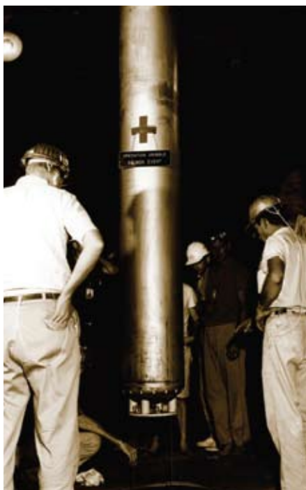
THE 1964 SALMON EVENT, A FIVE KT DETONATION CONDUCTED 280 METRES DEEP IN A MISSISSIPPI SALT DOME, CONFIRMED THE THEORY OF DECOUPLING AS A MEANS OF CONCEALING CLANDESTINE NUCLEAR EXPLOSIONS. IN THIS PHOTO, EXPERIMENTERS ARE LOWERING A CANISTER CONTAINING THE NUCLEAR EXPLOSIVE FOR THE SALMON EVENT.