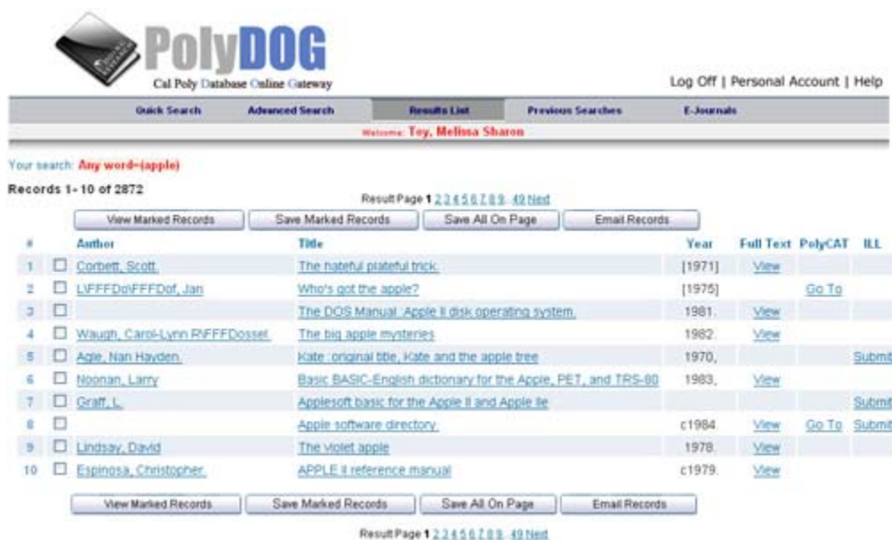
Figure 3: Redesigned Metalib Results Page

Throughout the quarter, the student team met with the librarians and presented their designs and suggestions. Their overall results were submitted to the library in the form of a final project report. This work was found to be so productive and useful, that the library carried on and presented the recommendations to the product vendor, who has subsequently incorporated many of them into a new release of their commercial product.