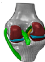
Figure 1: Right knee FEM

smoothed to remove any imperfections, before importing into SolidWorks (Dassault Systemes, Velizy-Villacoublay, France) to remove any residual overlap between structures. The ACL was divided into AM and PL bundles in SolidWorks based on their reported femoral and tibial attachment sites [4]. Soft tissue structures were meshed in TrueGrid (XYZ Scientific Applications, Inc., Livermore, California, USA) using linear, hexahedral elements. Bones were modeled as rigid bodies with 2-D shell elements. Each mesh was imported into Abaqus (Dessault Systemes, Velizy-Villacoublay, France) for FEM analyses (Figure 1).