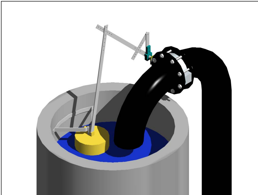
Figure 3. Present Design of an Up-and-Over Pressure Regulator for DEID.

This first design functioned very well in field tests, but it was difficult to install. DEID staff also determined that the existing district on-off valves were deteriorating, and that they needed to be replaced. Therefore, a second design that incorporates a new DEID shutoff valve and an up-and-over pipeline supply was developed and field tested. The top of the design is shown in Figure 3.