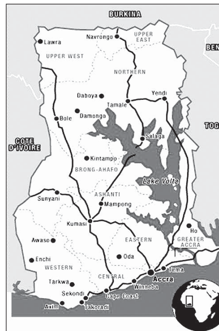
Figures 1 & 2. The location of Ghana and Accra, and a comparative table of population densities in several world cities.

Ghana is located on the West Coast of Africa (Figure 1). The country lays north of latitude 4 degrees north and is intersected by longitude 0 degrees, the Greenwich Meridian. Ghana is a former British Colony named the Gold Coast. Thus the official language of government is English although there are several local languages of which seven are officially used on radio. The country covers an area of 238,477 square-kilometers (or 93,000 square-miles) and is about the size of the state of Oregon.