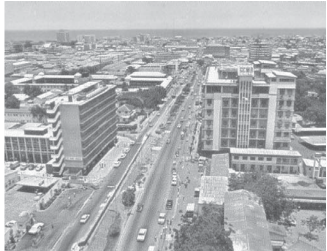
Figures 3 & 4. Streetscapes of Accra. A major thoroughfare towards the CBD showing the ocean in the background, and a major traffic circle on the way to the downtown.