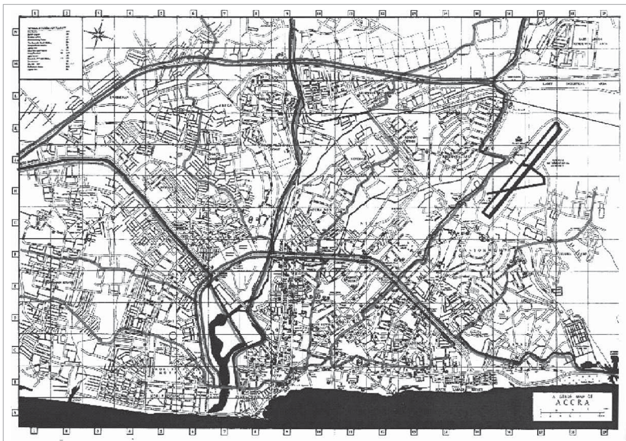
Figure 5. Proposed physical layout of the Accra BRT Plan.

A vision statement for the BRT plan was articulated as follows: “A network of high capacity bus rapid transit routes