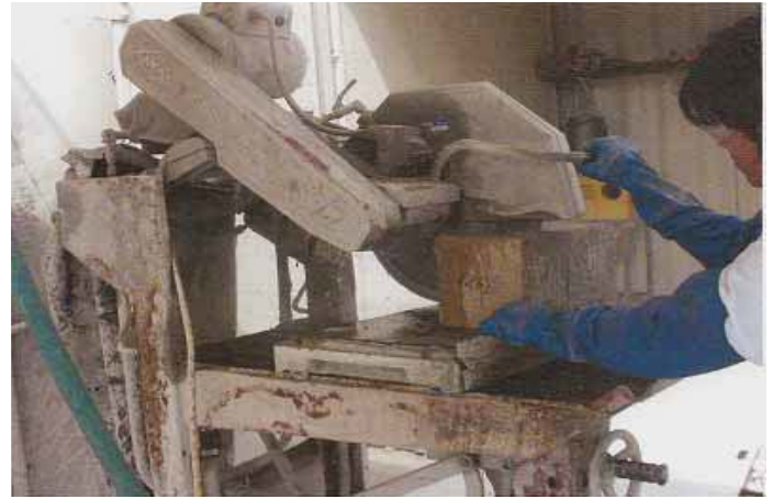
Figure 4: Saw-Cutting of Grout Specimens from Concrete Masonry Unit

Compression test samples were made from the grout specimens by saw cutting the grout specimen to the dimensional requirements of ASTM C1019 (as shown in Figure 4). The test samples were cut two days prior to testing. After cutting, samples were returned to their specific curing environment until testing. The specimens were capped and tested in compression in accordance with ASTM C1019 as shown in Figure 5.