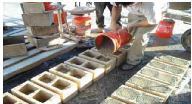
Figure 2: Grout Placement in Concrete Masonry Unit Cells

Grout specimens were prepared and tested in accordance with ASTM C1019. In order to save material, space and simulate water absorption required in ASTM C1019, the specimens were cast within the hollow cells of 8"x8"x16" CMUs as shown in Figure 2.