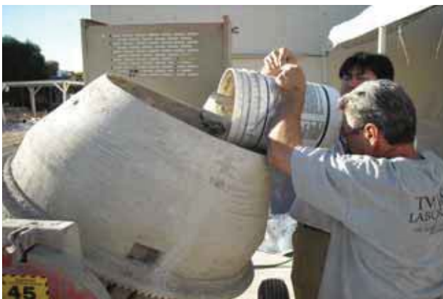
Figure 1: Adding Grout Materials to a Mechanical Mixer

The materials for the coarse grout were proportioned by volume and batching was performed in accordance with Table 1 of ASTM C476. The materials were mixed in a mechanical mixer in accordance with ASTM C476 as shown in Figure 1.