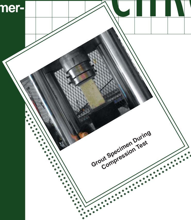
Grout Specimen During Compression Test