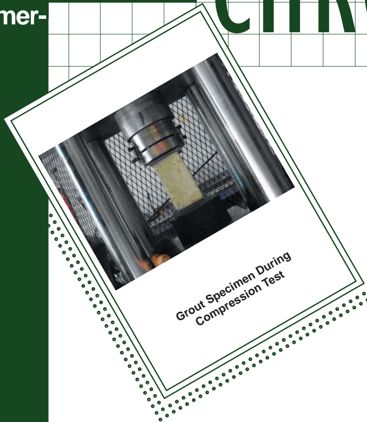
Grout Specimen During Compression Test