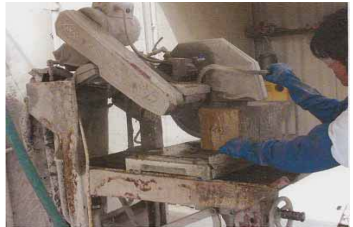
Figure 4: Saw-Cutting of Grout Specimens from Concrete Masonry Unit

Compression test samples were made from the grout specimens by saw cutting the grout specimen to the dimensional requirements of ASTM C1019 (as shown in Figure 4). The test samples were cut two days prior to testing. After cutting, samples were returned to their specific curing environment until testing. The specimens were capped and tested in compression in accordance with ASTM C1019 as shown in Figure 5.