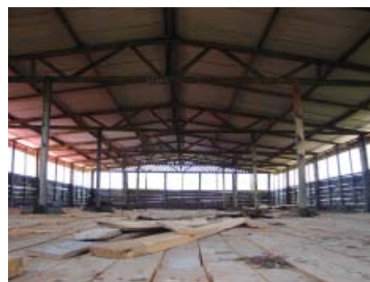
Figure 4: No Lateral System