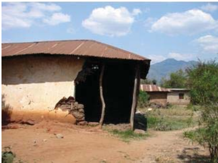
Figure 5: Adobe Brick Water Decay

The main building material in rural East Africa is adobe. The reasons are obvious for its popularity; the resources (mud and sun) are plentiful and free. However, adobe has limitations.