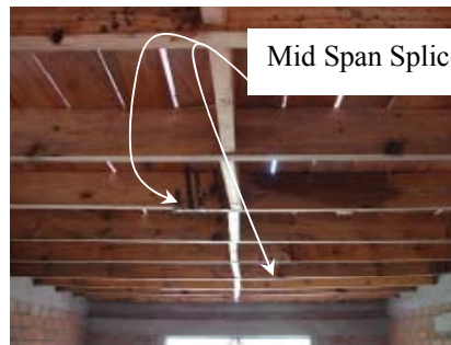
Figure 2: Typical Beam Splice