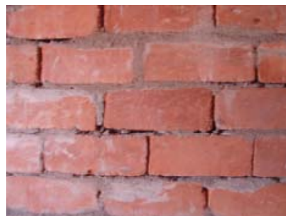
Figure 3: Poor Mortar Joints