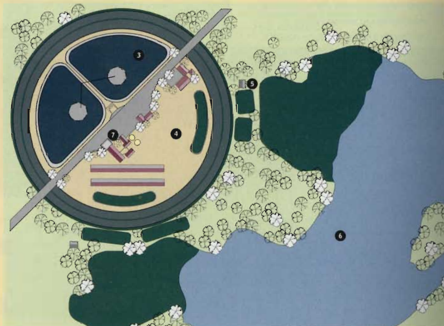
Resource recovery facility