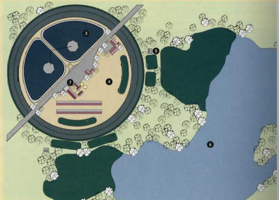
Resource recovery facility