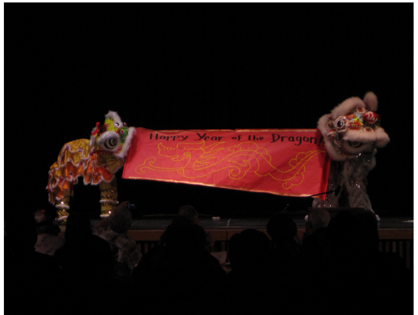
Lion Dance Team performing at CSA's 55th Chinese New Year Banquet

The Cal Poly Lion Dance Team was hard at work this Lunar New Year. Around this time, the team composed of all students, got requests from local restaurants and businesses to perform a ceremonial blessing for good luck. Restaurants all the way from Atascadero requested the performers to bless their establishments. Some known restaurants include Lotus and Golden China. Schools and service groups have also asked for the Lion Dance team to perform for educational purposes including two dorms in Cal Poly. The Lion Dance team also performs in the Chinese New Year Banquet hosted by CSA. The members of the Lion Dance Team are always happy to show San Luis Obispo the cultural significance of the Lunar New Year and its customs.