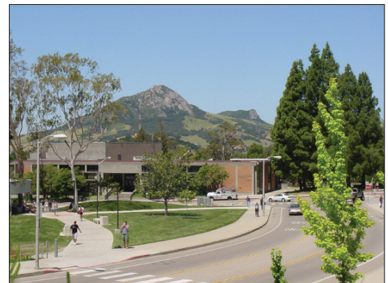
Julian A. McPhee University Union with Bishop Peak in the background