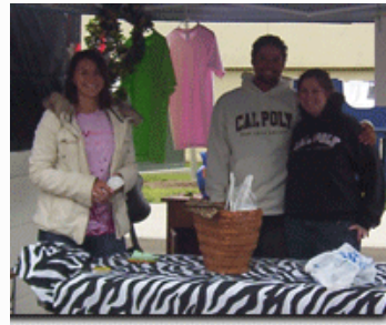
REC Club Open House Booth