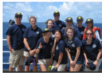
RPTA Students at Sea

Along with our coursework, we have participated in many interesting Cal Maritime Academy (CMA) activities. These events have included a Sunday BBQ and karaoke dance party, hackie sack on the helo-deck, sun bathing