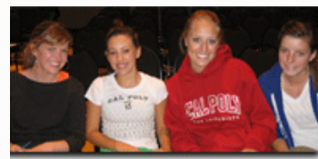
RPTA students at PBC seminar

Who spends $400,000 to move a single tree from one spot to the other to preserve the beauty of their resort? Pebble Beach Company does. Pebble Beach is one of the most well-known golf-resort travel destinations around the world, that's why investments such as these are crucial to giving their customers the world-class experience they pay for and expect to receive.