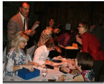
Students volunteering at SARC