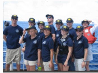
RPTA Students at Sea

Greetings from the Golden Bear! The ten of us and Dr. Goldenberg just crossed across the equator earlier today in the Pacific Ocean. We have been at sea for 11 days and are keeping busy with our classes and activities on board. The REC 400 students are currently planning programs such as a workshop on how to play the sport of cricket, a traditional Tongan dance, and