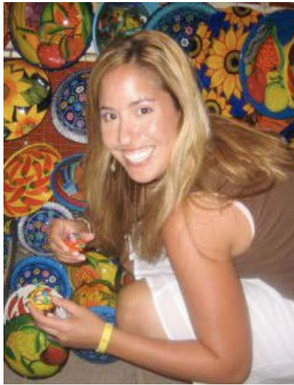
1998 from Cal Poly in Recreation Administration, with an emphasis in