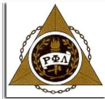
Rho Phi Lambda Crest

Rho Phi Lambda is an honorary, professional Recreation, Parks, and Leisure Fraternity that aspires to recognize, promote, and encourage students of high moral character. To be a member of Rho Phi Lambda, students must have an overall GPA of 3.0 and a major GPA of 3.2 as well as demonstrate evidence of leadership and service to the community. Several members of Rho Phi Lambda have become mentors for 1st year students in Cal Poly's first ever mentoring program. This year's