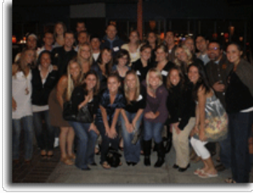
REC students and faculty at CPRS Conference

To start, I had a great experience at the conference and feel every student would not only benefit educationally from the conference but would also enjoy the social interaction with other CPRS members. My week at the conference started by working our Cal Poly booth on Wednesday afternoon with other students. My responsibilities included answering guest's questions and sharing my opinions on Cal Poly's program and the school as a whole. After my shift at the booth I explored the convention center and took a quick look at the other booths. Later that evening a mixer was held at the Long Beach Aquarium for all the CPRS members to get acquainted with one another.