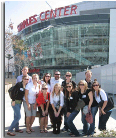
REC students and faculty outside Staples Center