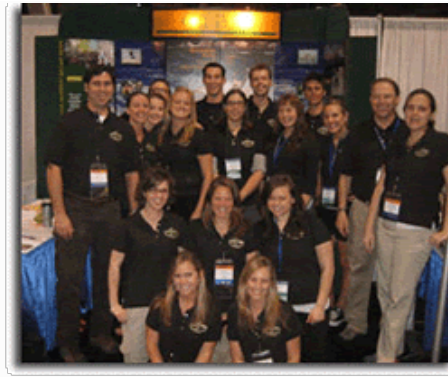
CPRS Cal Poly REC program booth

students. Students are needed to help staff the booth and to walk the newly admitted students from the REC Center to the Farm Shop. Please contact Kendi Root kroot@calpoly.edu if you are interested in volunteering.