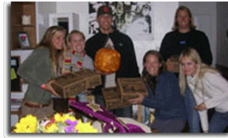
REC Club members