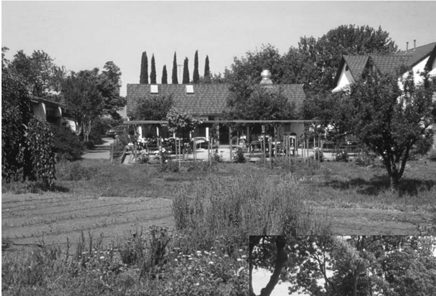
Figure 3. Images of Village Homes